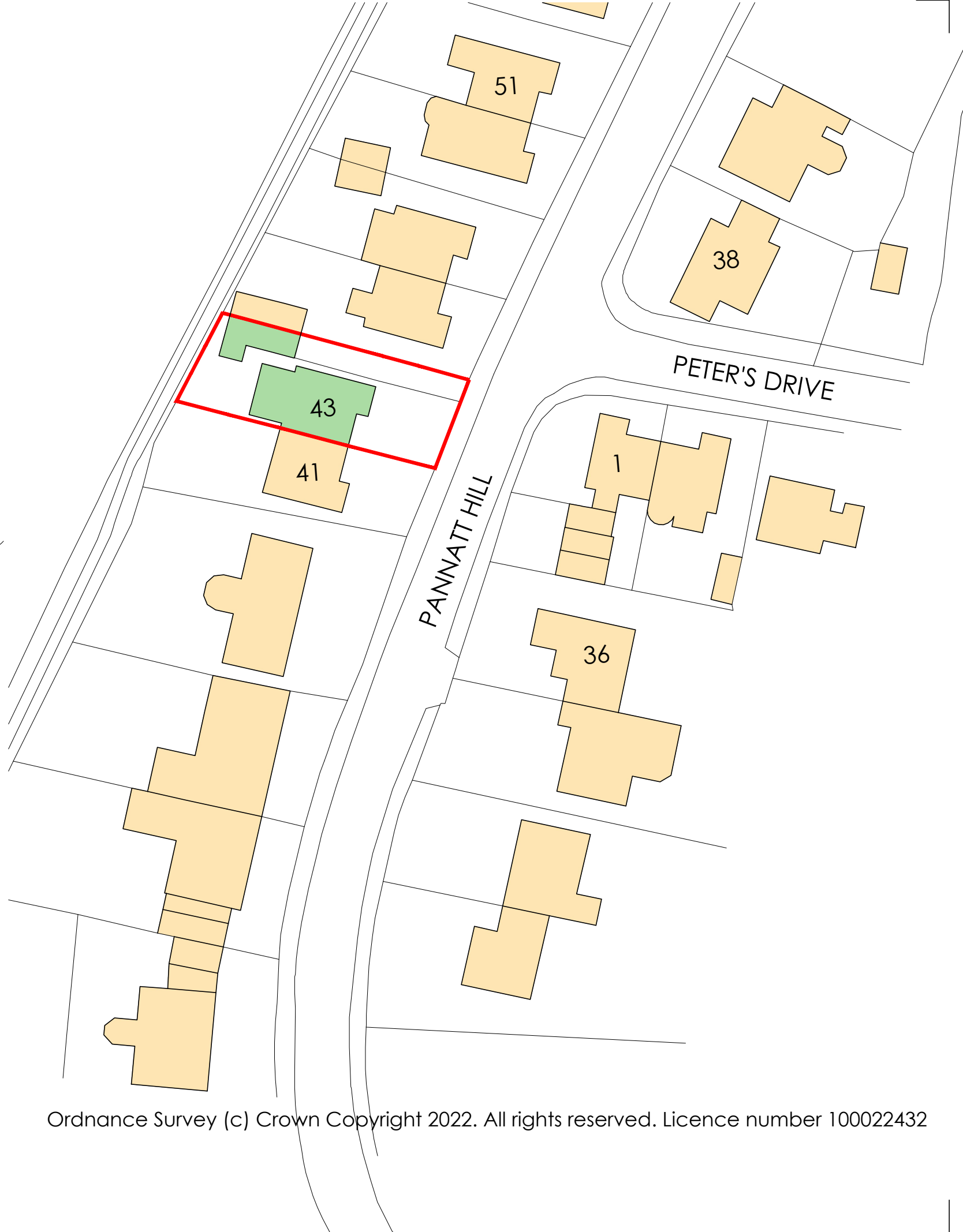
BLOCK PLAN @ 1:500 ▷ 0m 5 10 15 20 25m