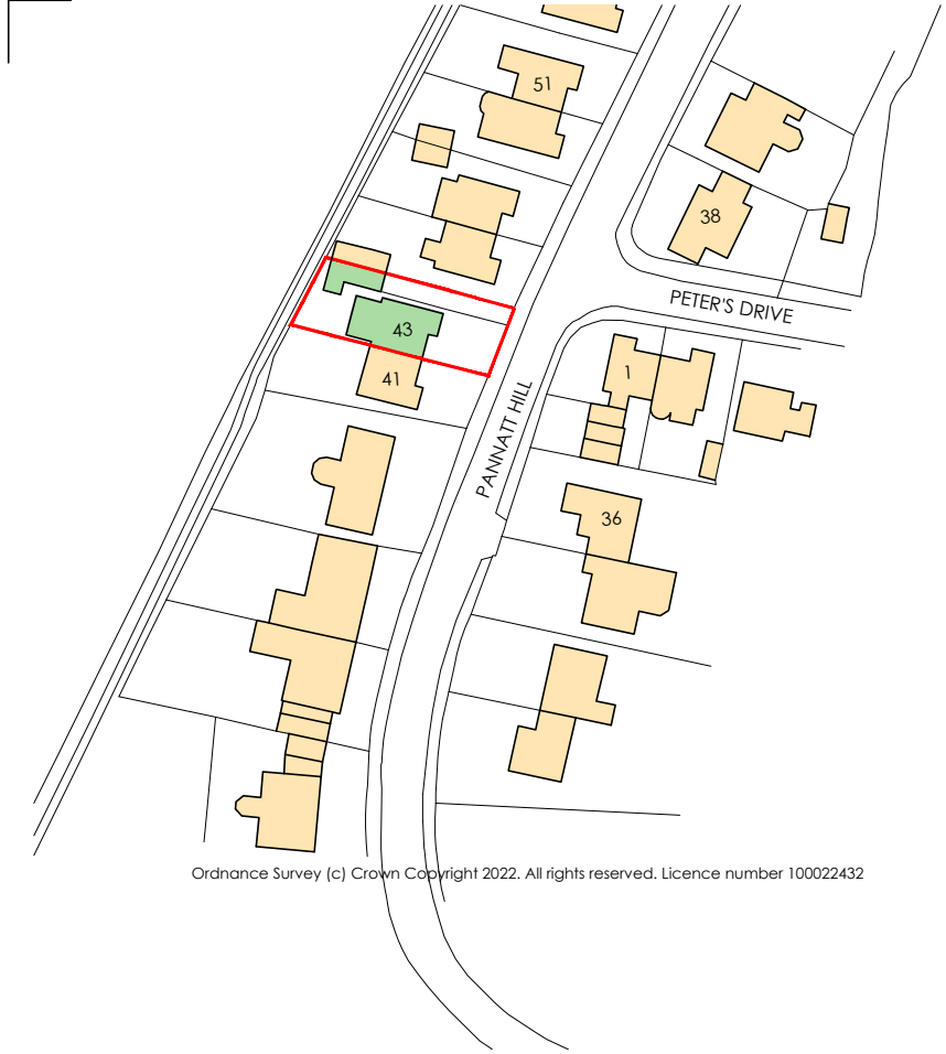
△ LOCATION PLAN @ 1:1250 △ 0m 10 25m 50m 75m 100m