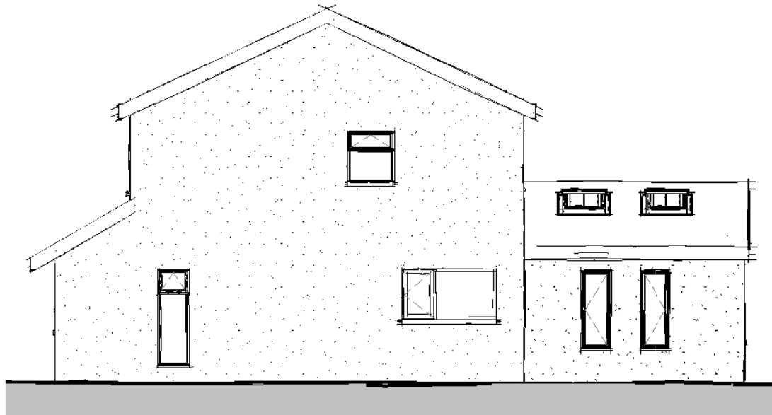
Side Elevation 02