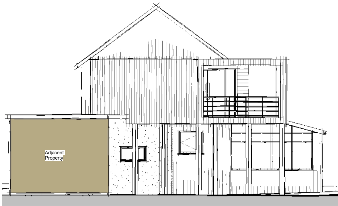
Side Elevation 01 1 : 100