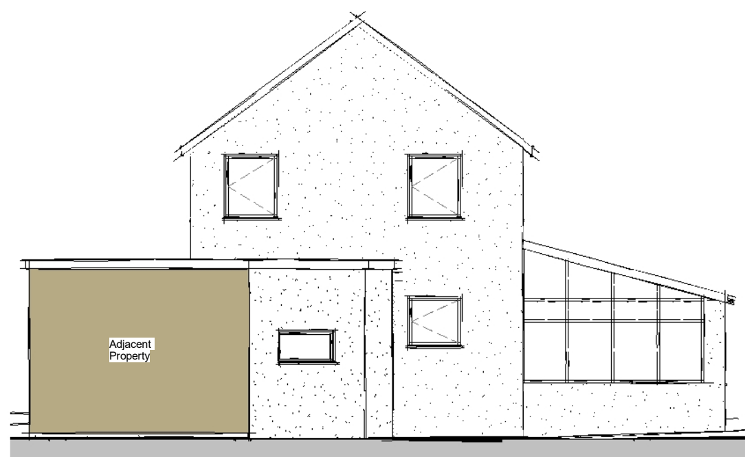
Side Elevation 01