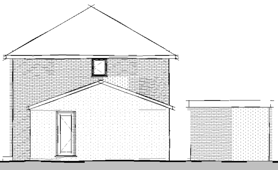
Side Elevation 01 1 : 100