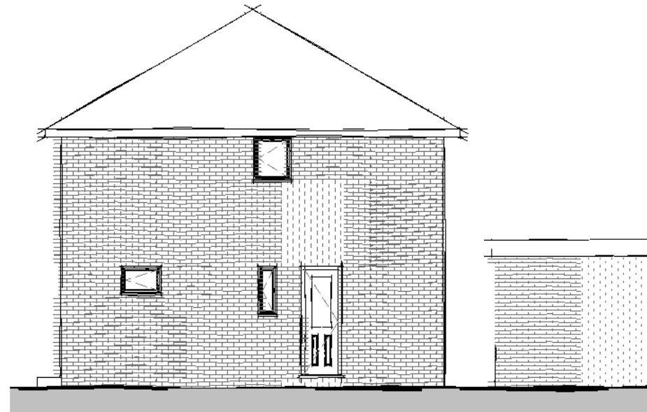
Side Elevation 01