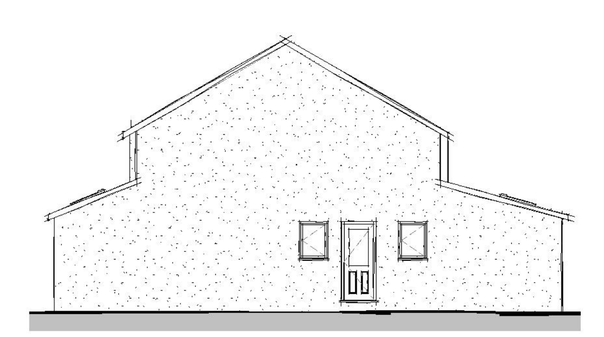
Side Elevation 01