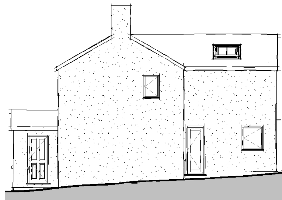
Side Elevation 01