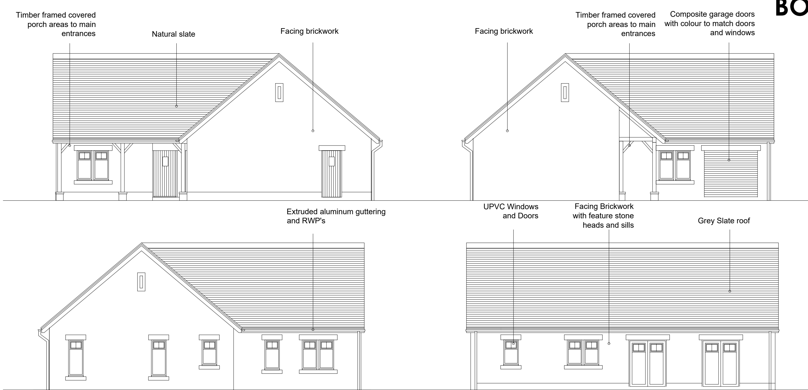
Elevations Type A 1:100