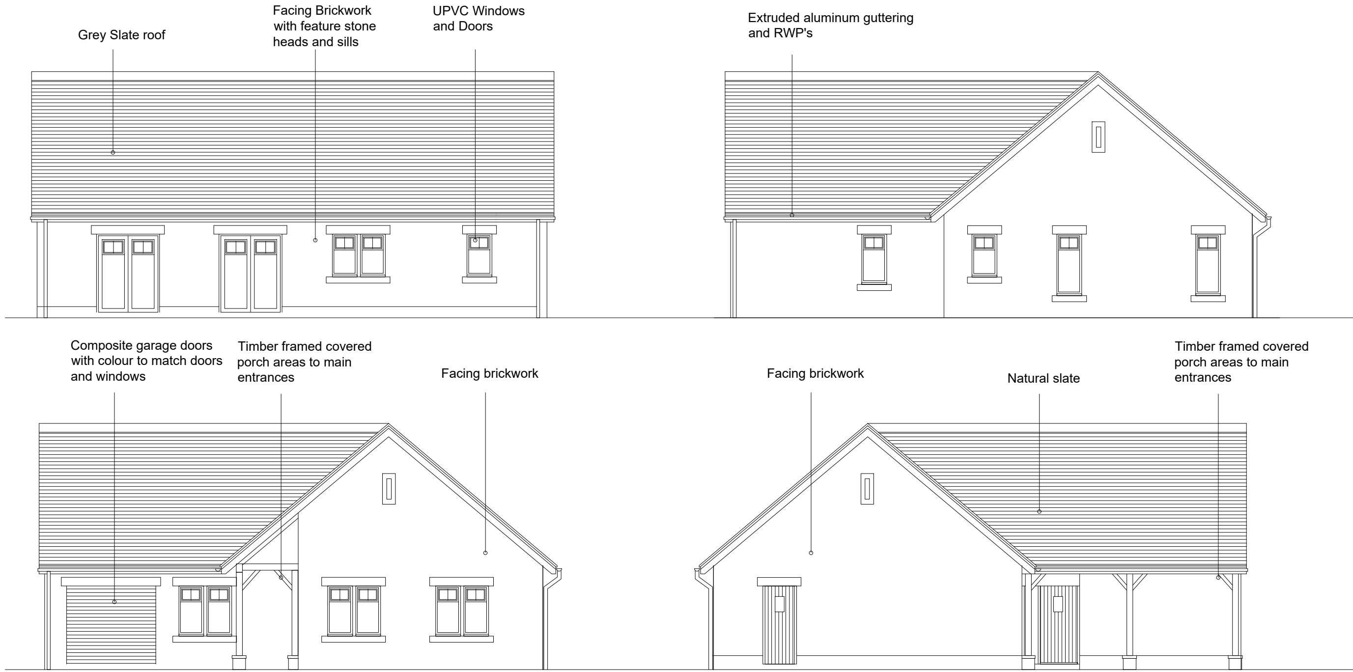
Elevations Type B 1:100