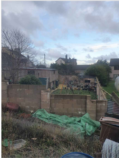
VIEW - G