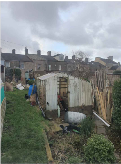
VIEW - D