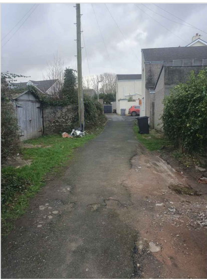
VIEW - C