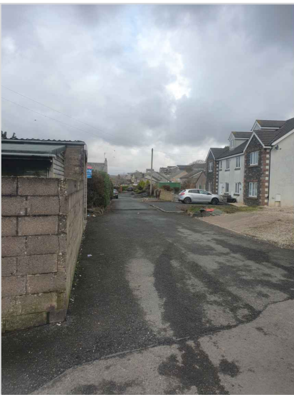
VIEW - A