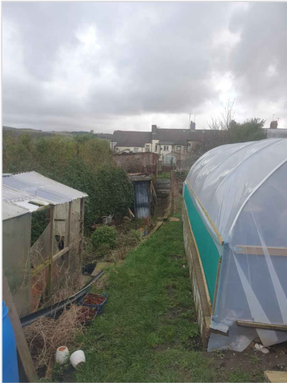
VIEW - F