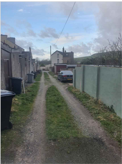
VIEW - B