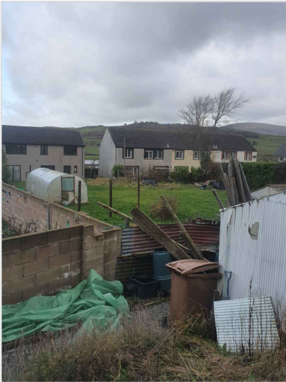
VIEW - E