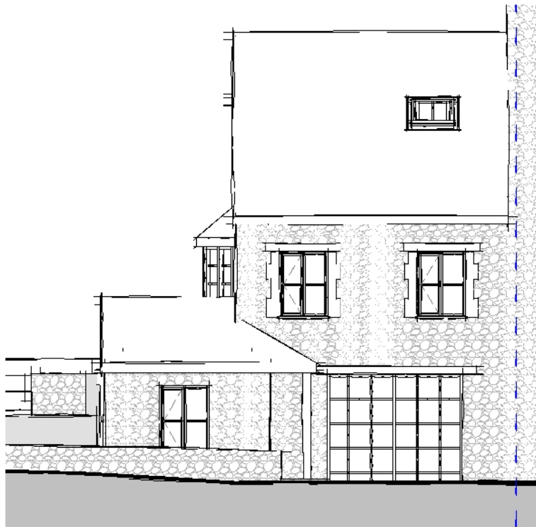
Front Elevation 1 : 100