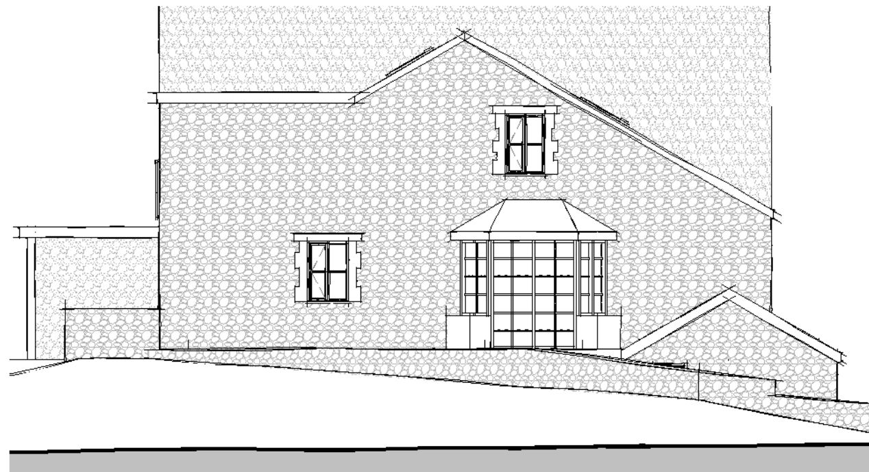
Side Elevation 02 1 : 100