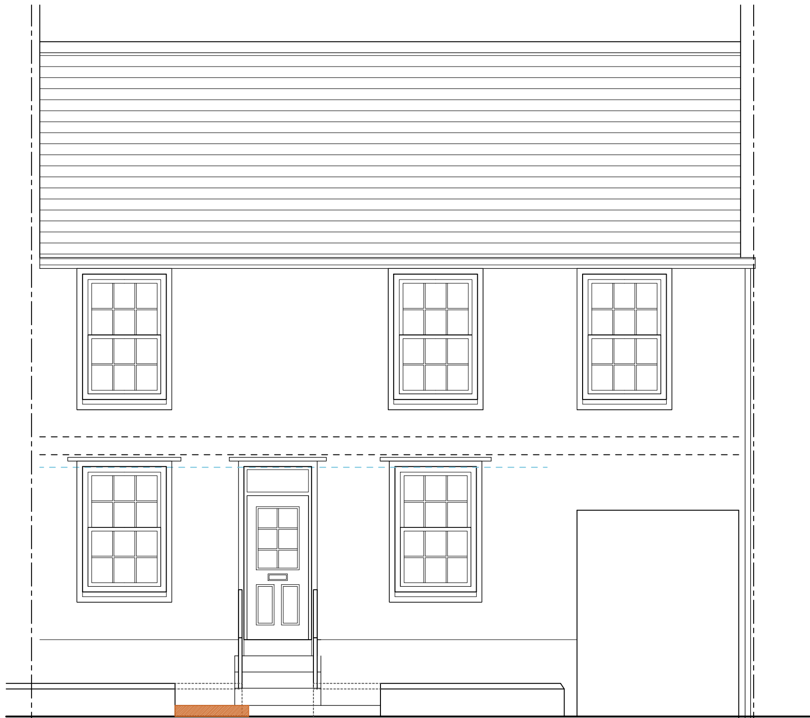
FRONT ELEVATION AS PROPOSED 1:50 @ A2 / 1:100 @ A4