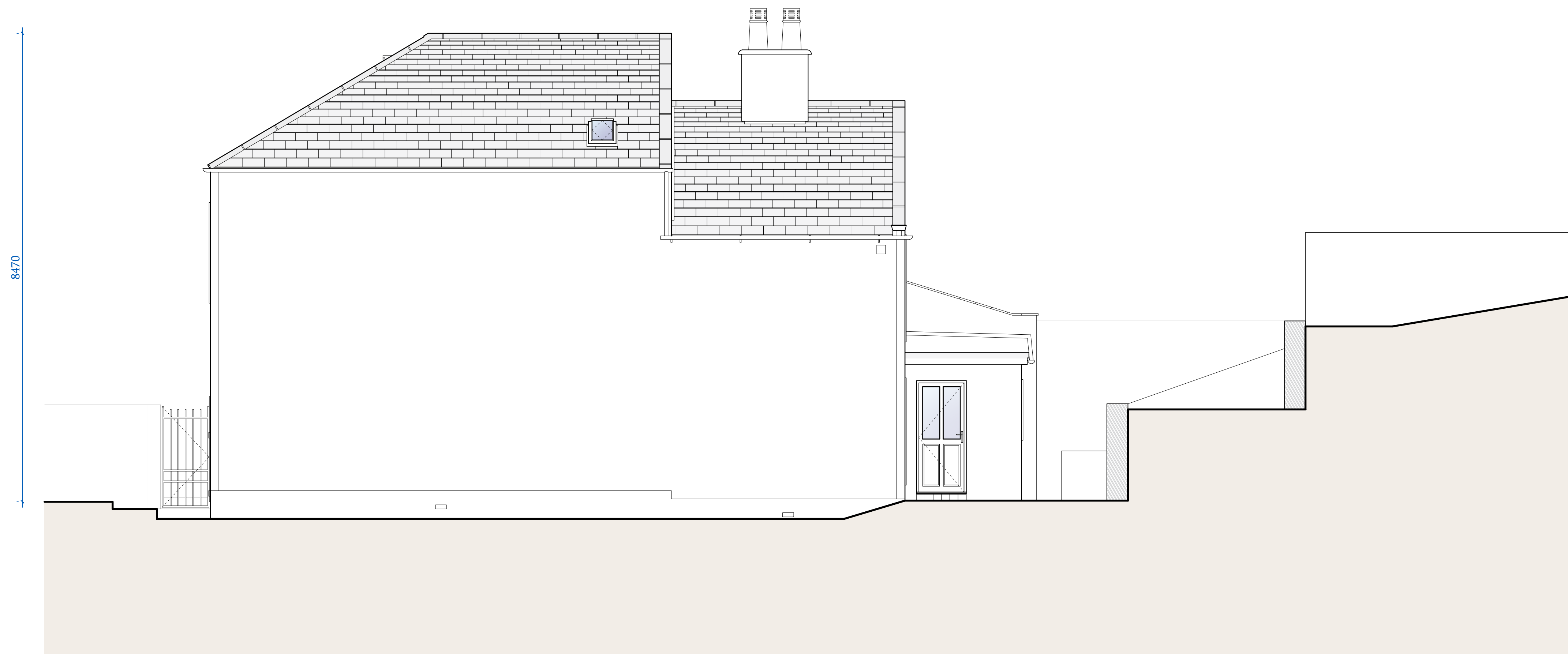
7 Elevation - Side (South-West Facing) Scale - 1 : 50 @ A1