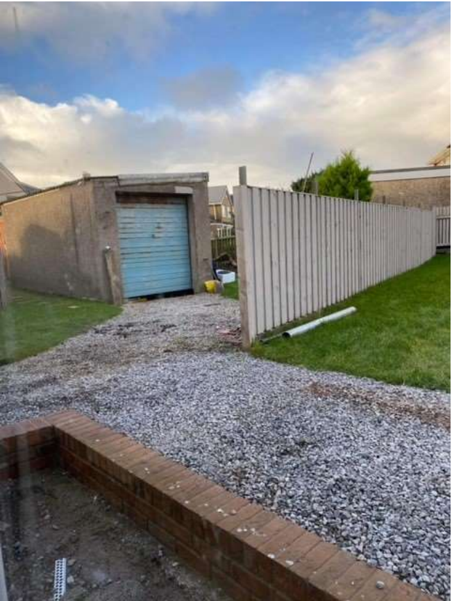
Image B Gravel access route / timber fence / brickwork step.