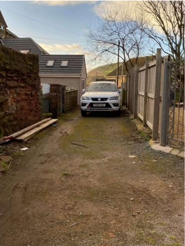
Image C Neighbour (No.5) demonstrating vehicular use of the new gravel access route with large vehicle & trailer.

Drawings subject to relevant statutory approvals.