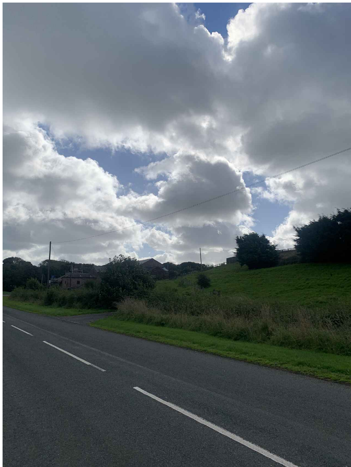
View of existing access from B5345.