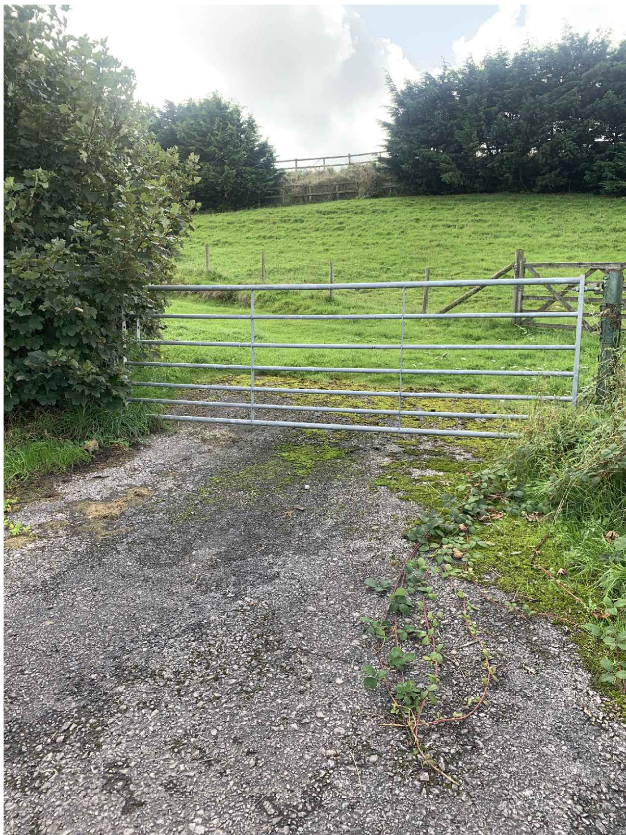
View of existing entrance.