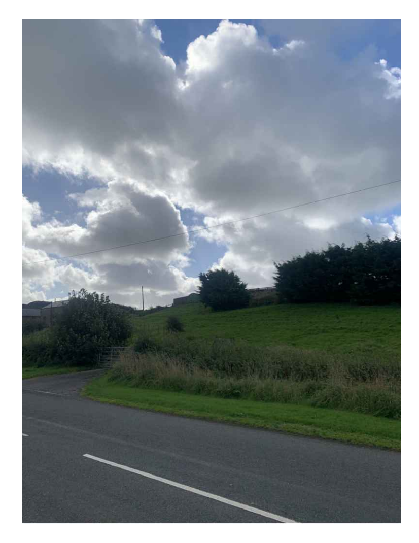
View of existing entrance from B5345.