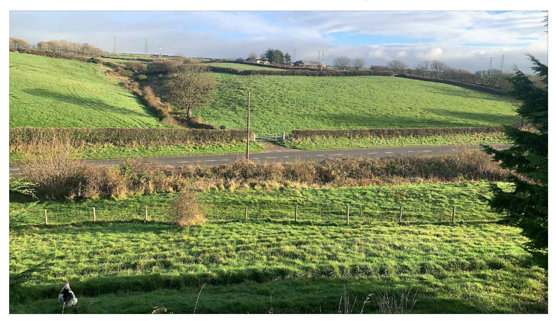
View of proposed parking area from pod site.