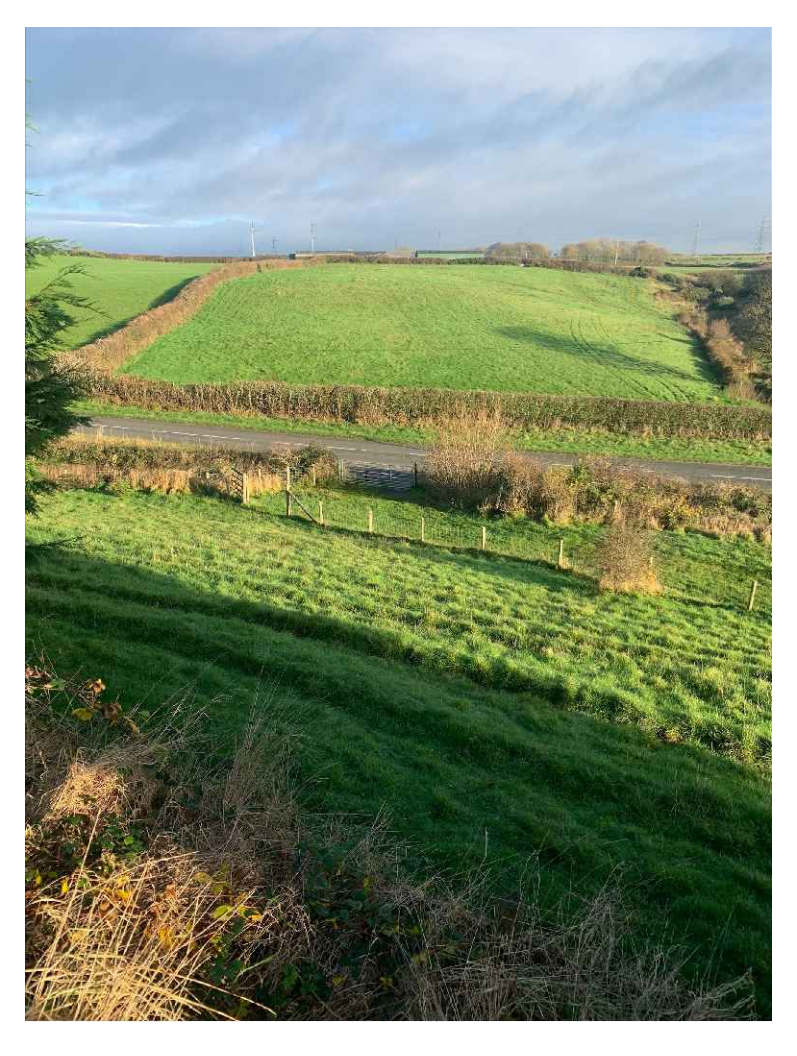
View of existing entrance from site.