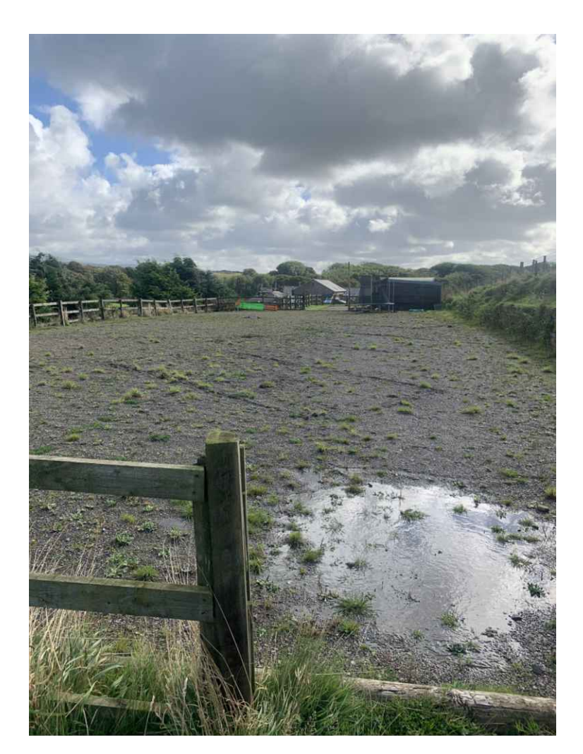
View of proposed pod site facing Southeast.