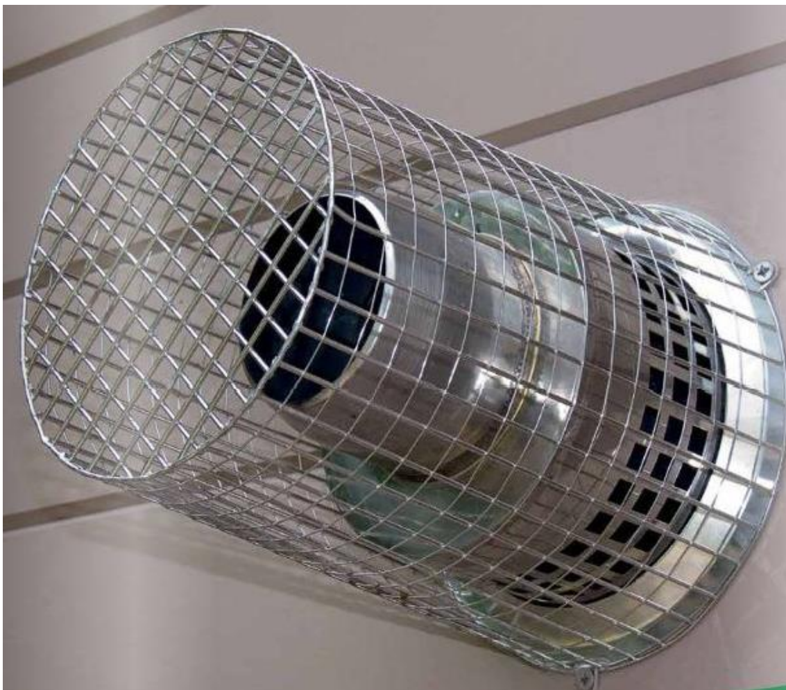
Flue outlet with protective guard fitted.