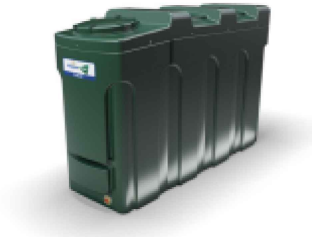
OIL STORAGE TANK Bunded tank on concrete slab N. T. S.

© COPYRIGHT MANNING ELLIOTT PARTNERSHIP 2020.