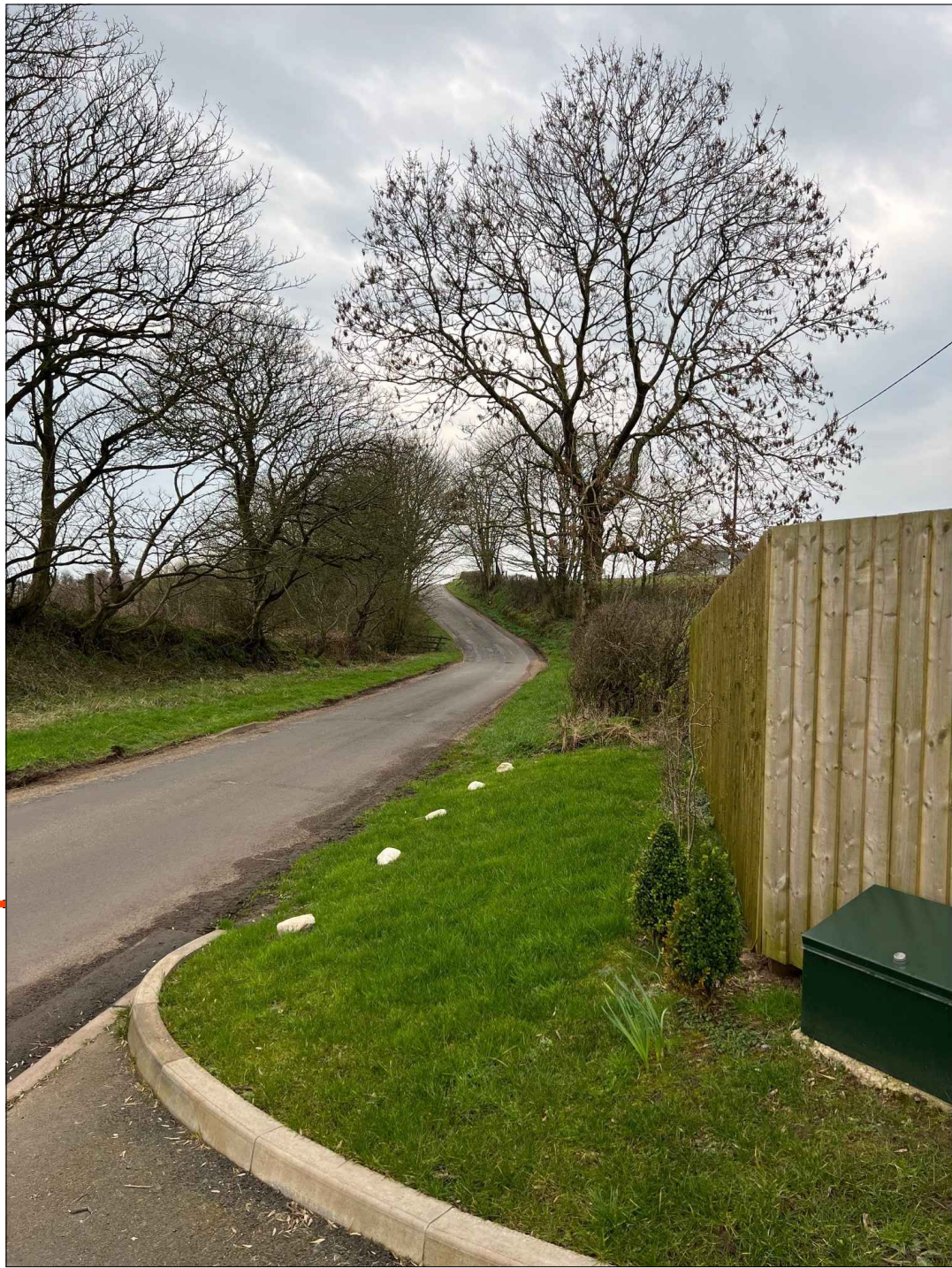
Exit visibility looking west from a central location on the access and 2400mm back from highway edge.