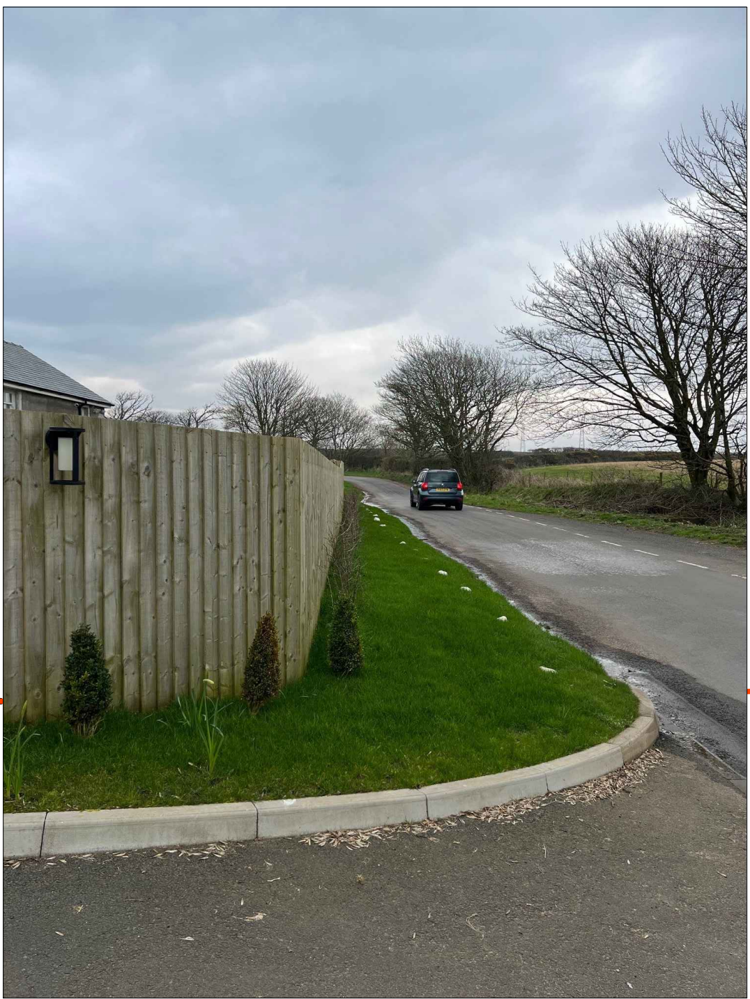
Exit visibility looking east from a central location on the access and 2400mm back from highway edge.

© COPYRIGHT MANNING ELLIOTT PARTNERSHIP 2020. THIS DRAWING IS THE PROPERTY OF MANNING ELLIOTT PARTNERSHIP. IT MUST NOT BE COPIED OR REPRODUCED OR DIVULGED TO ANYONE WITHOUT PERMISSION. DO NOT SCALE OFF THIS DRAWING. ANY DISCREPANCIES TO BE REPORTED TO MANNING ELLIOTT PARTNERSHIP.