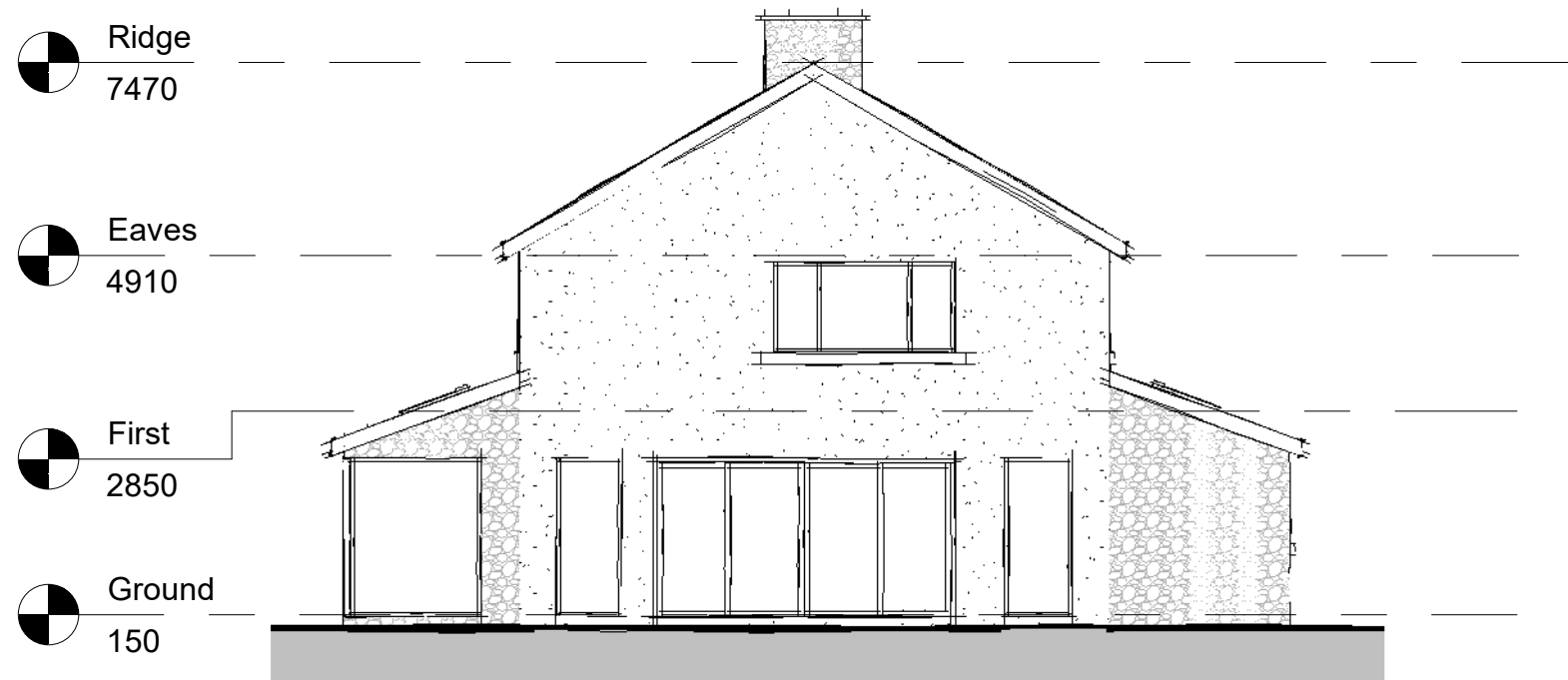
Side Elevation 01