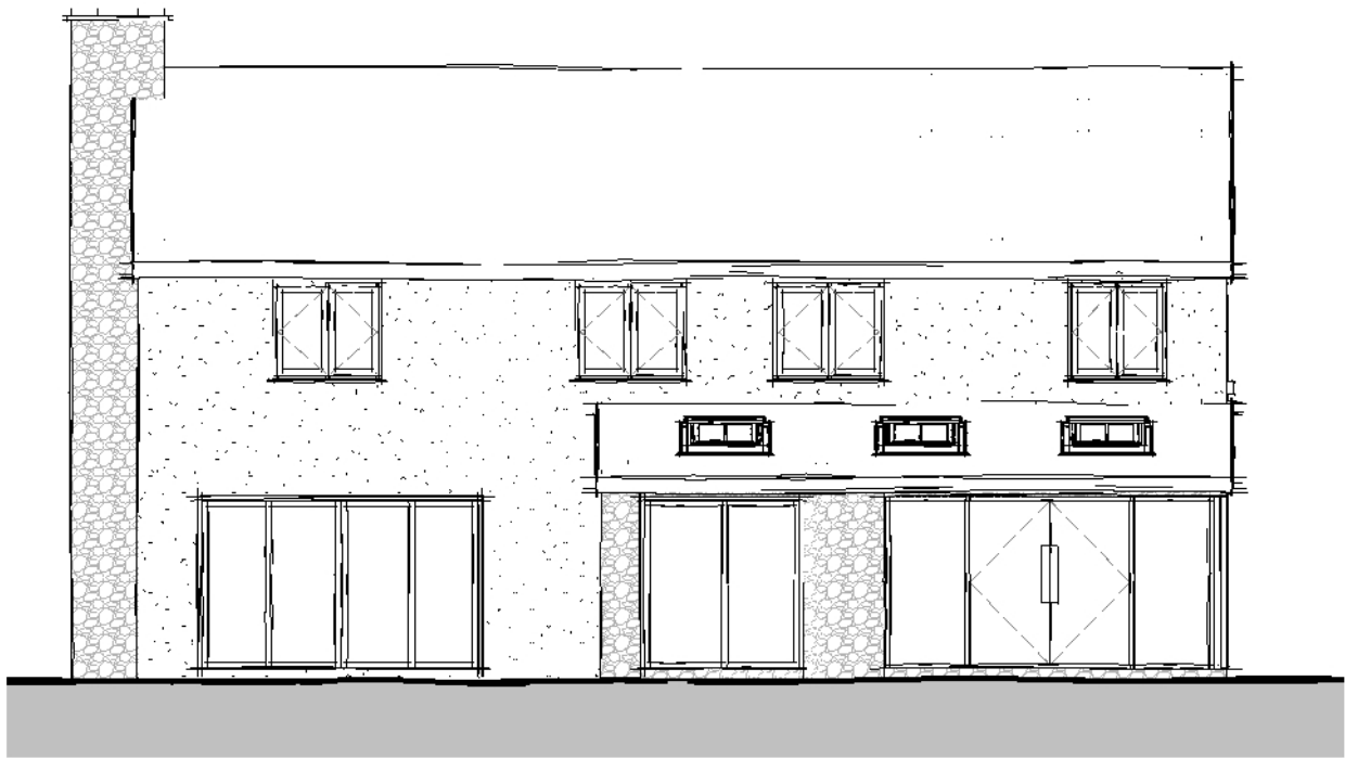
Rear Elevation 1 : 100