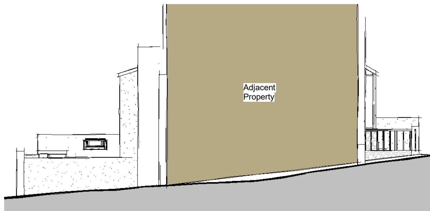
Side Elevation 02 1 : 100