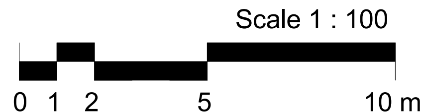
Side Elevation 02 1 : 100