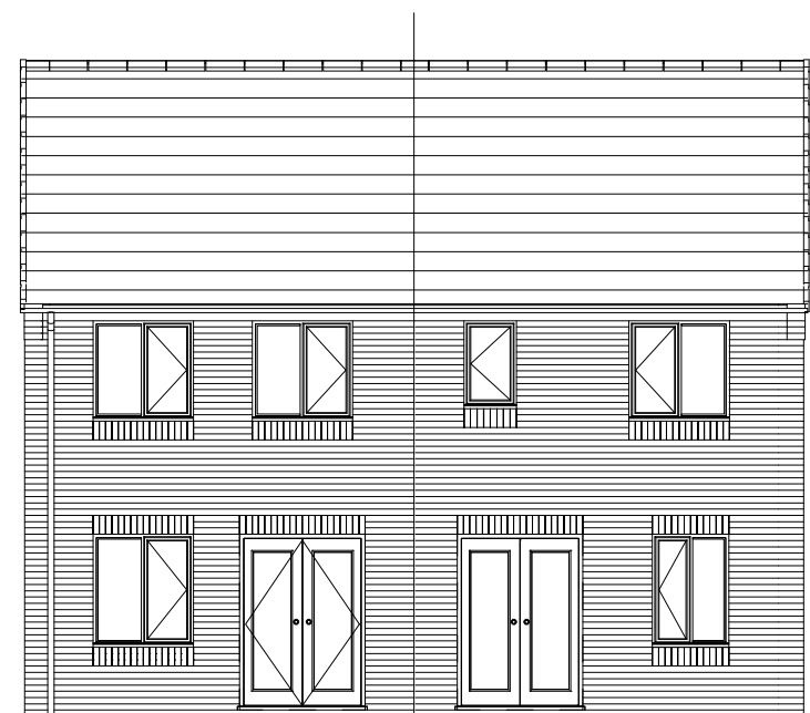
301 211 REAR ELEVATION