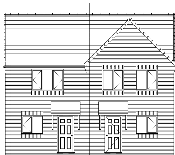
211 301 FRONT ELEVATION