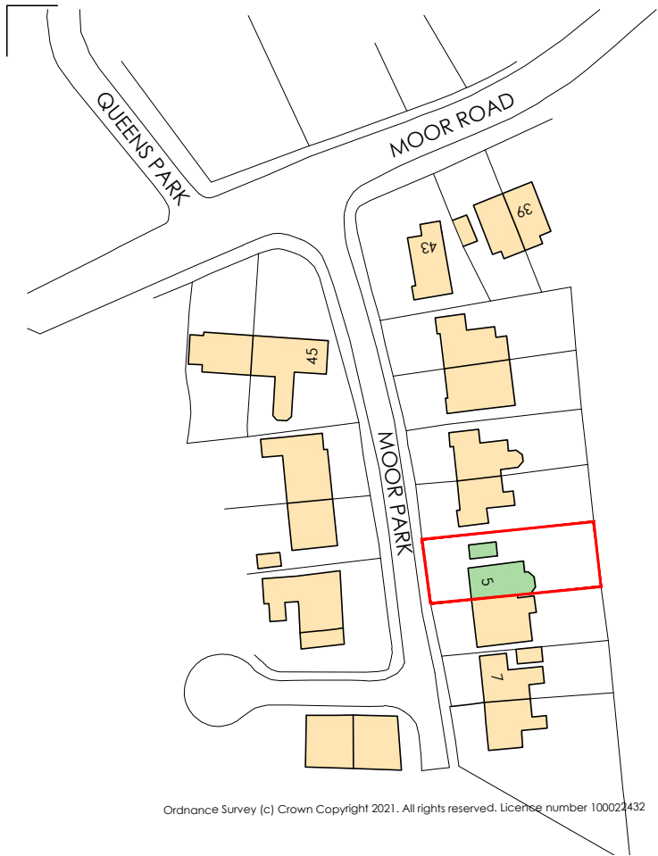
△ LOCATION PLAN @ 1:1250 0m 5 10 15 20 25m 50m 75m