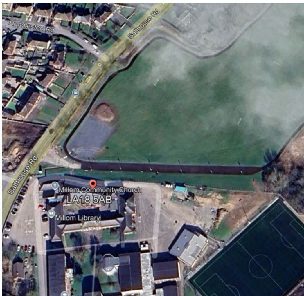
2025 Google Aerial Image showing the playing field with active track