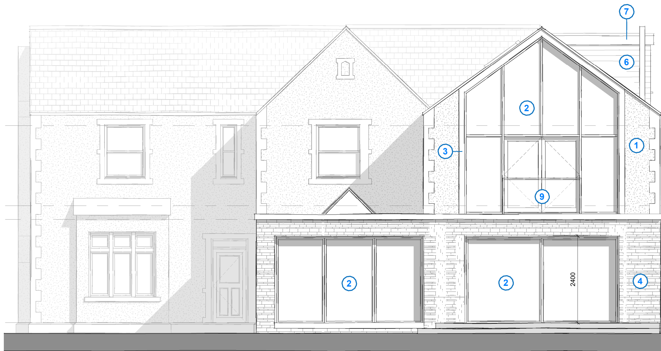
1 Proposed Front Elevation 1 : 50