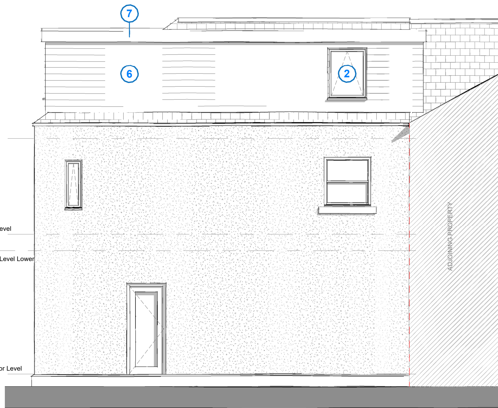
2 Proposed Rear Elevation 1 : 50