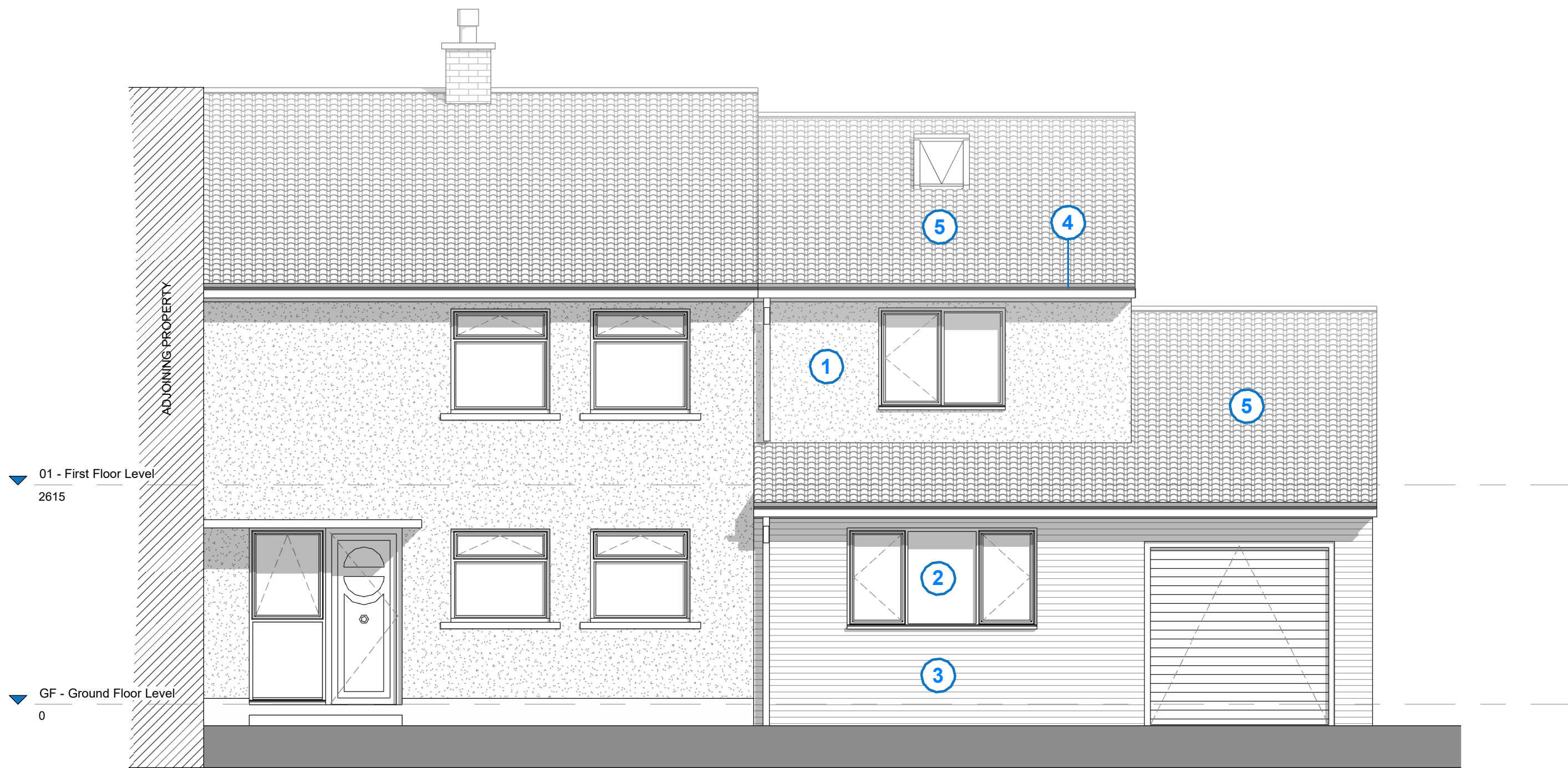
1 Proposed Front Elevation 1 : 50