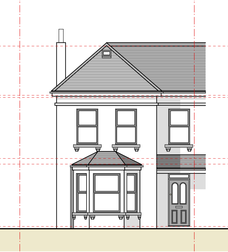
Existing Front Elevation A Scale 1:100 @ A3