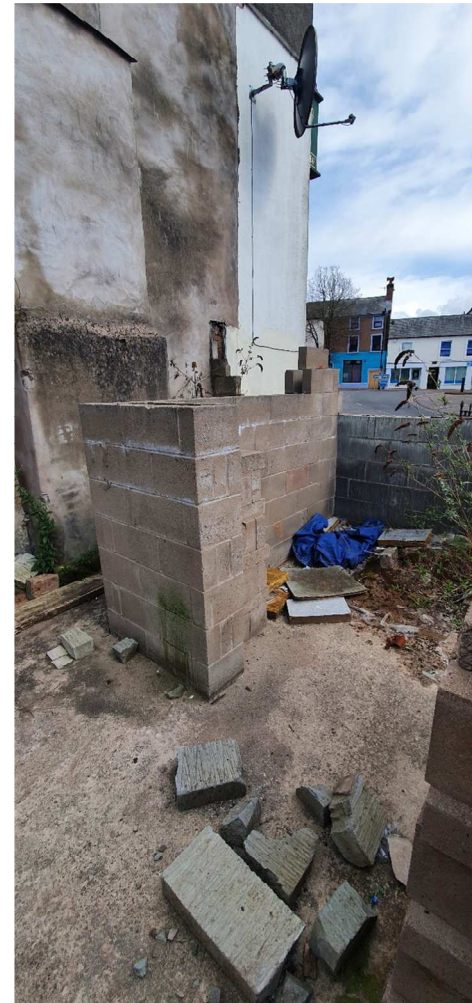
Part complete construction.

All remedial works are to be addressed during construction works of the proposal. Where necessary by condition, additional construction details to be provided to the Local Planning Officer prior to implementation.