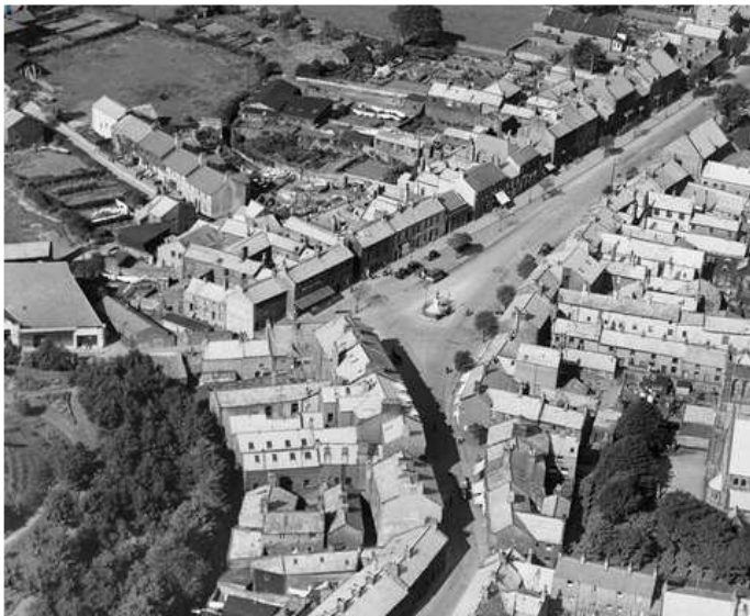
Aerial Image 2 – Site viewed North- North East