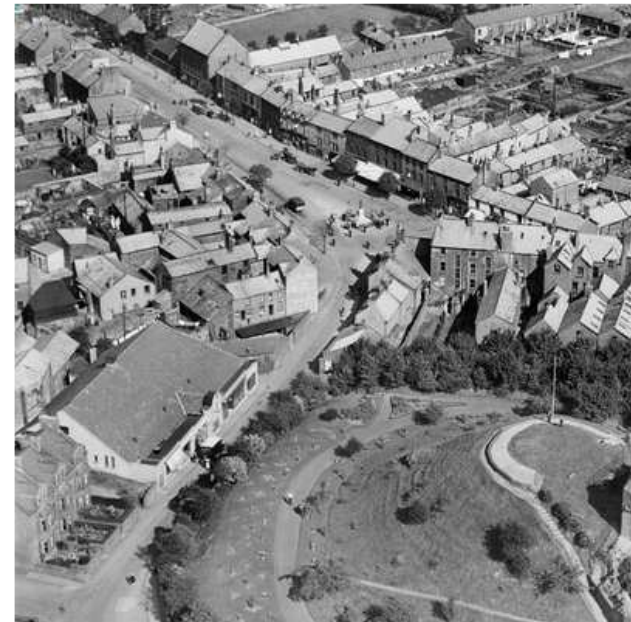
Aerial Image 1 – Site viewed North-North West

A traditional palette of materials is proposed, in keeping with the surrounding buildings and the conservation area guide.