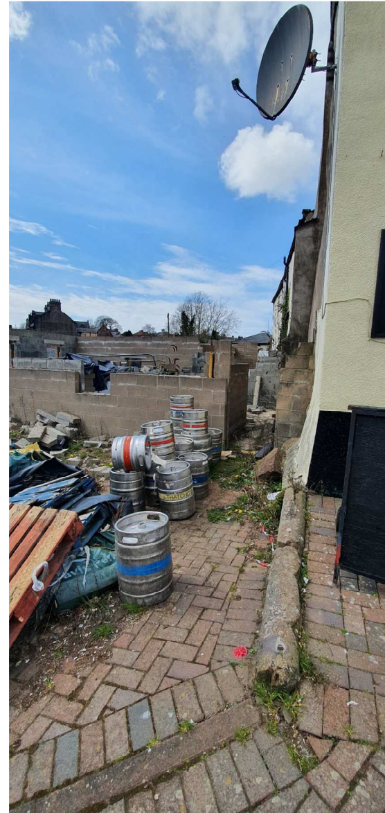
Completion of works to improve appearance of the Market Place area.

The development proposals positively contribute to the regeneration of the conservation area and enhancements are in line with the Conservation Area Design Guide.