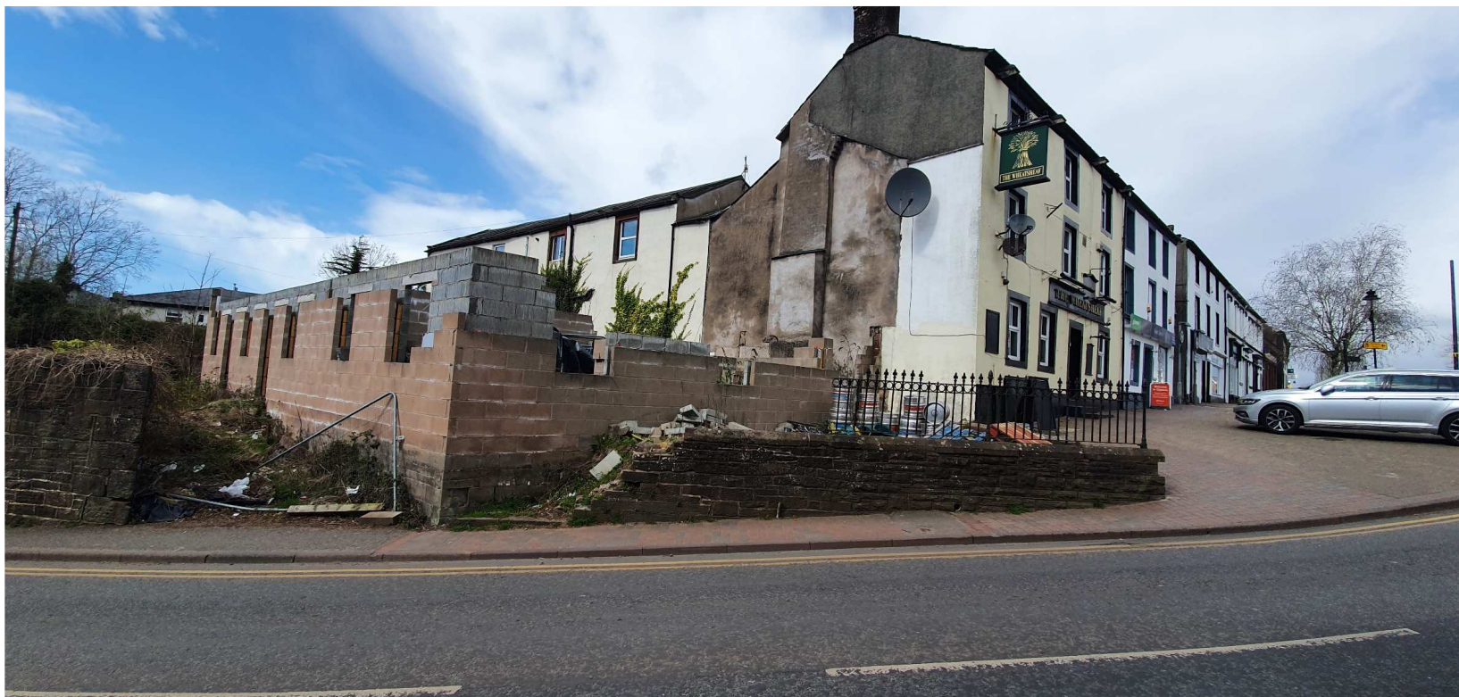
View towards site from Castle Villas (North-North East facing)

The project seeks permission for five bed House in Multiple Occupation utilising the existing structure which has been part erected under previous planning permission to build 3no. flats..