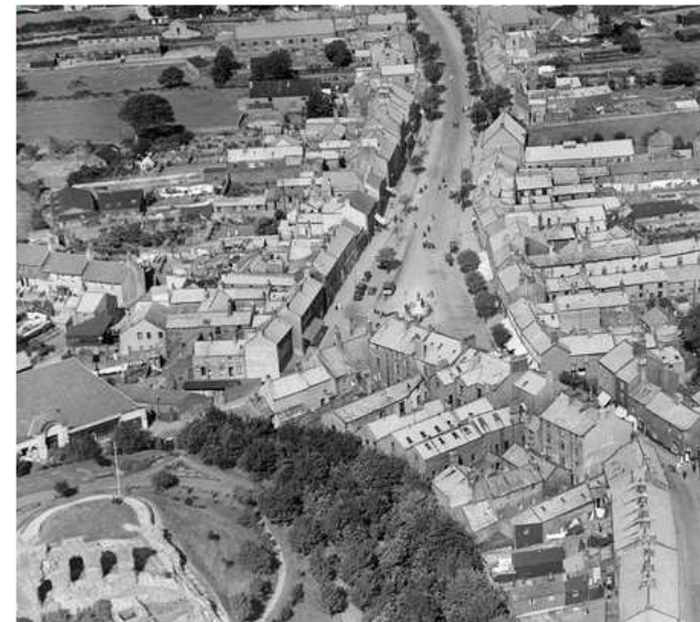
Aerial Image 3 – Site viewed North