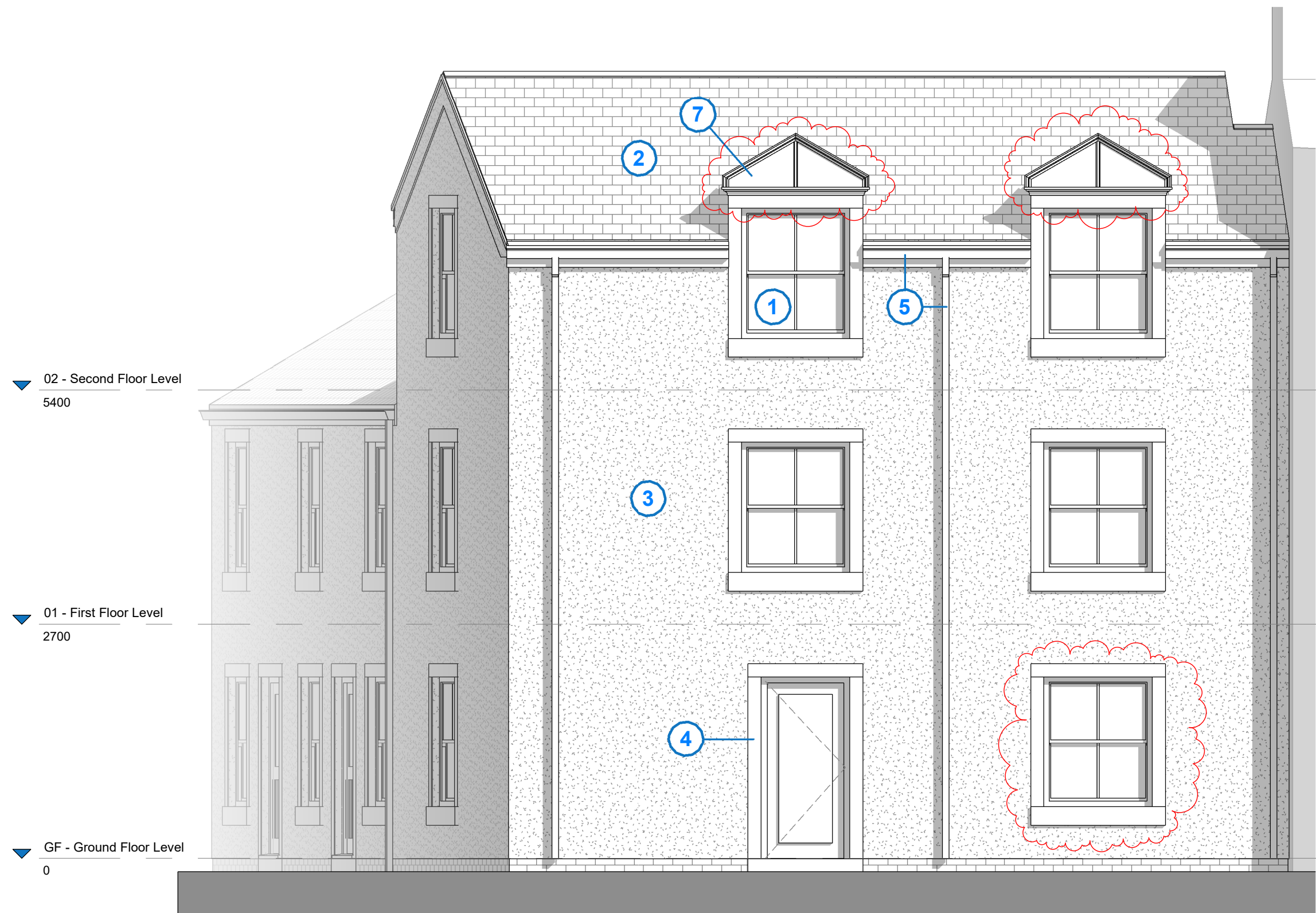
1 Proposed Front Elevation 1 : 50