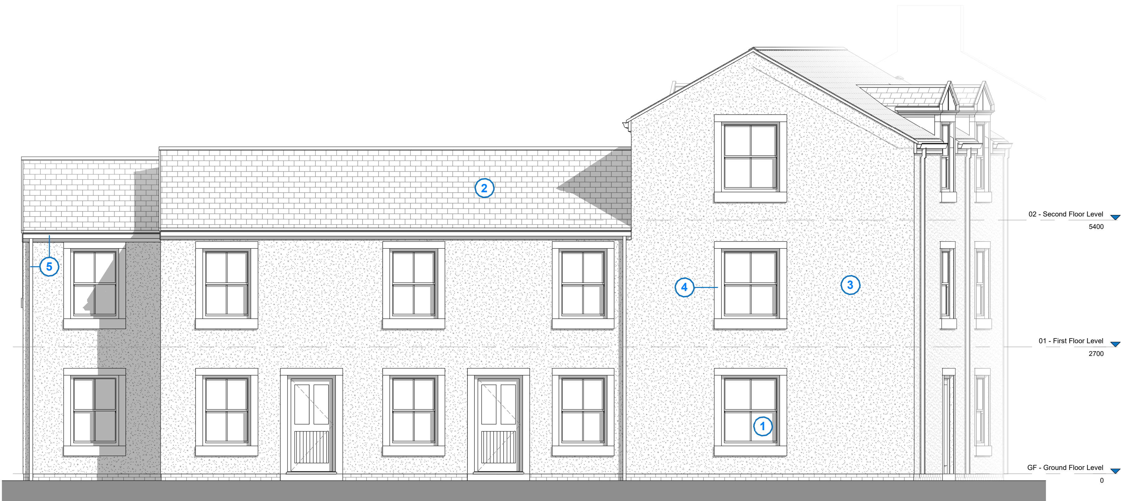
3 Proposed Side Elevation 1 : 50