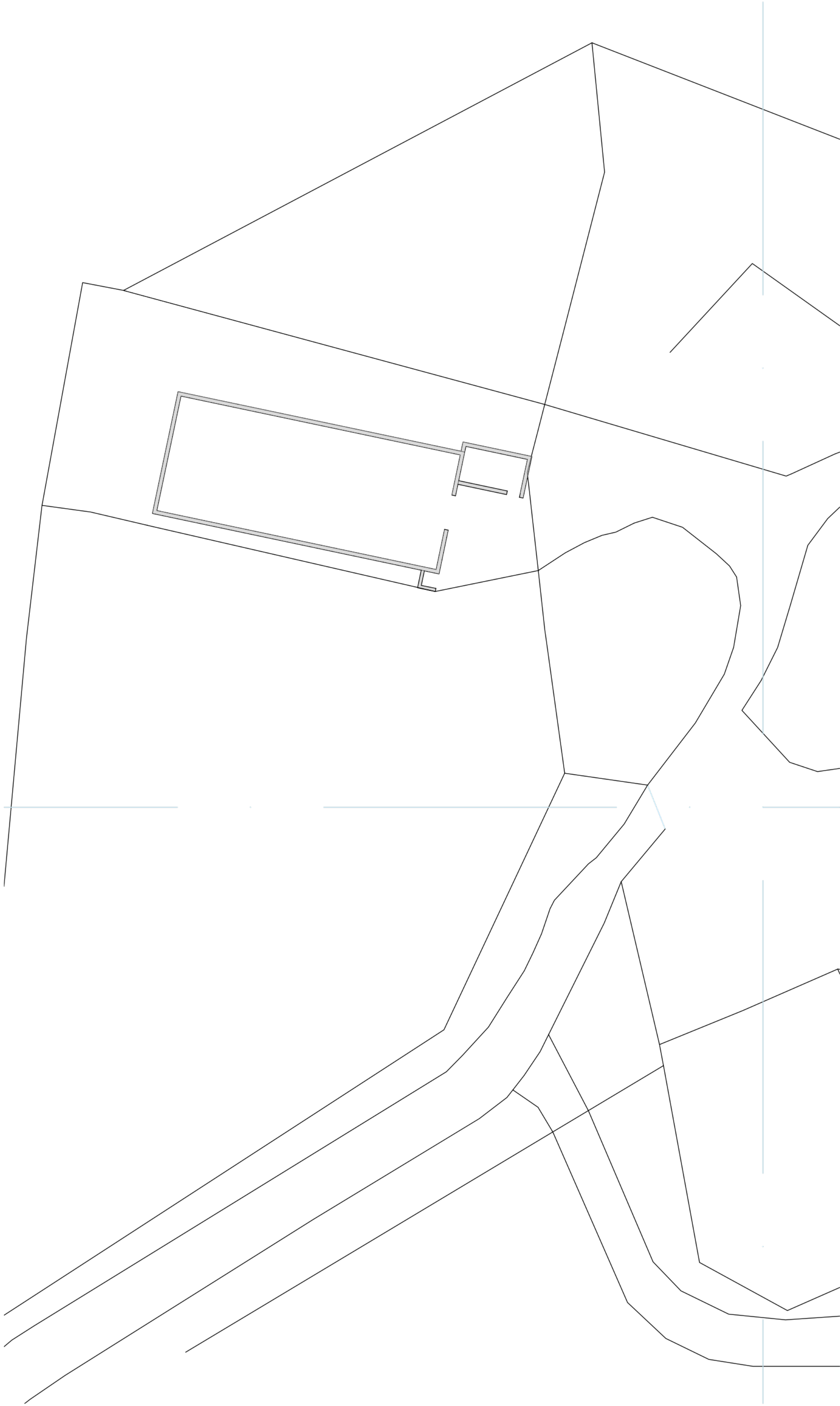
Existing Block Plan 1:200