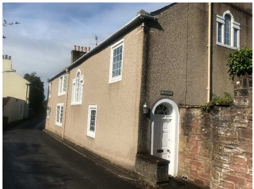
View 1: Front of the house from the east