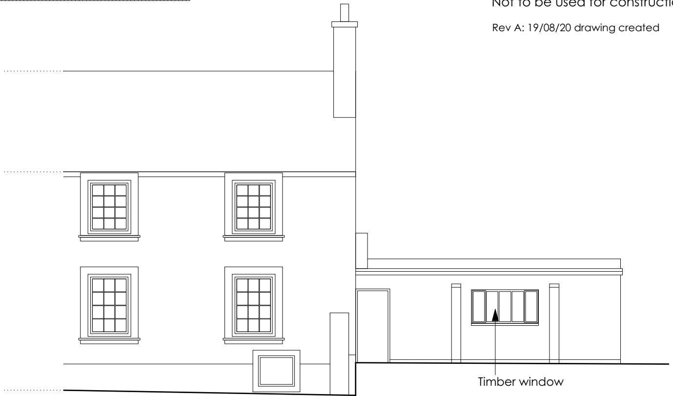
North elevation 1:100 @ A4

House roof: slate Garage roof: felt Walls: roughcast render Windows: all PVC unless marked otherwise Doors: all timber