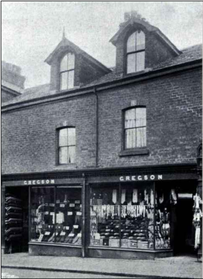
Photograph of 14 St Georges Terrace c1900