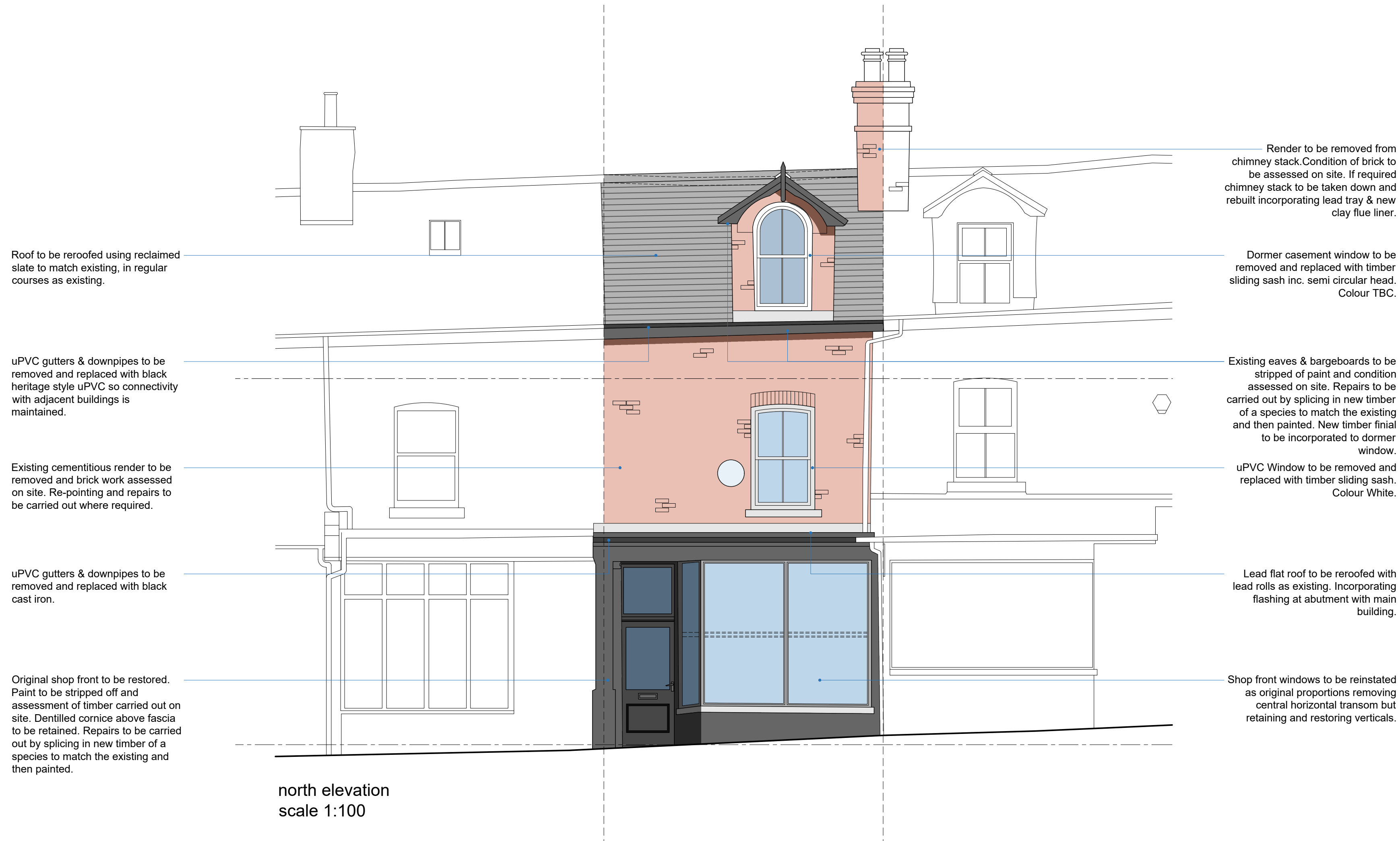
north elevation scale 1:100