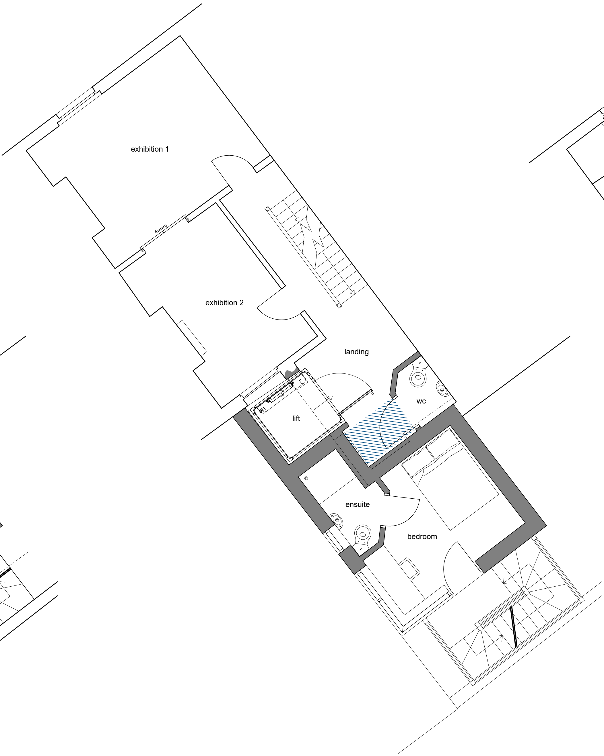
first floor plan scale 1:50