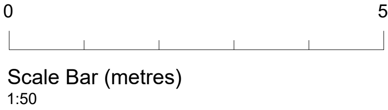
Scale Bar (metres) 1:50