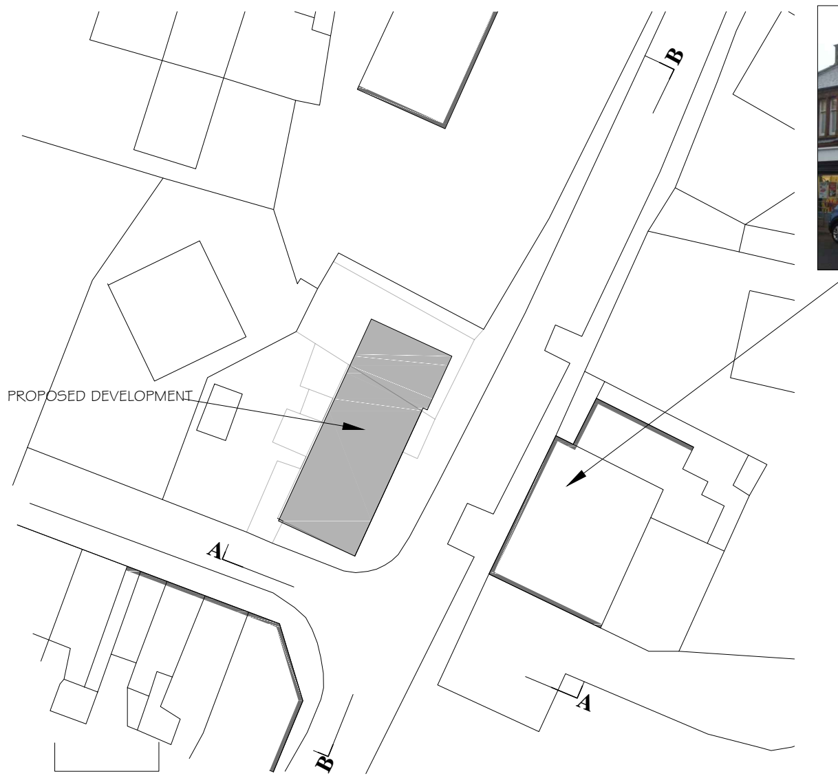
B L O C K P L A N 1 : 5 0 0