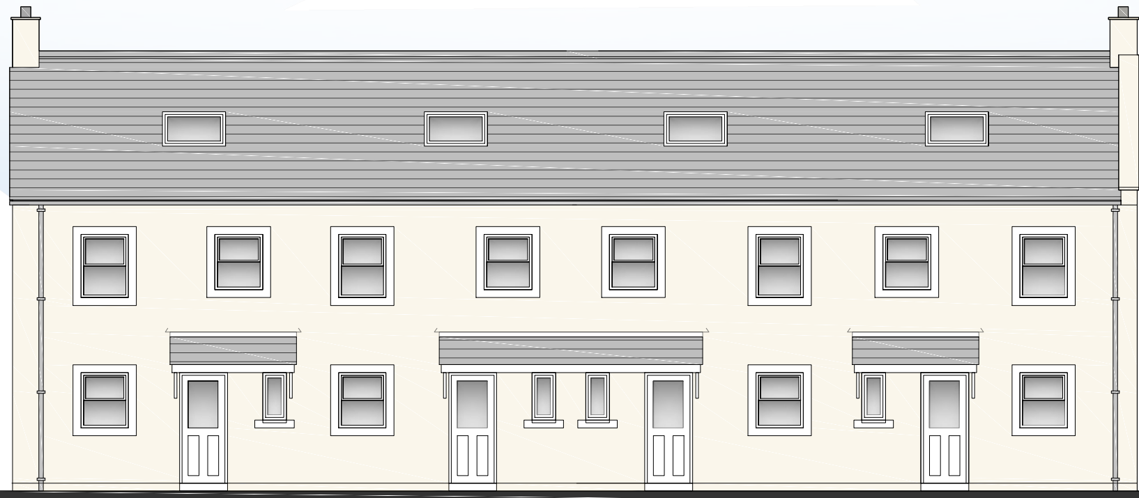
PROPOSED REAR ELEVATION ( North West )

EXTERNAL FINISHES: ROOF:- SLATE GREY TILES WALLS:- TRADITIONAL RENDER WINDOWS + DOORS:- UPVC R.W GOODS:- DEEP FLOW UPVC