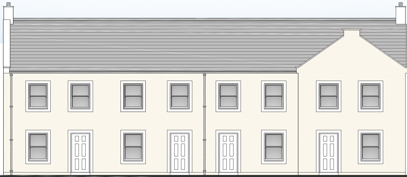
PROPOSED FRONT ELEVATION ( South East )