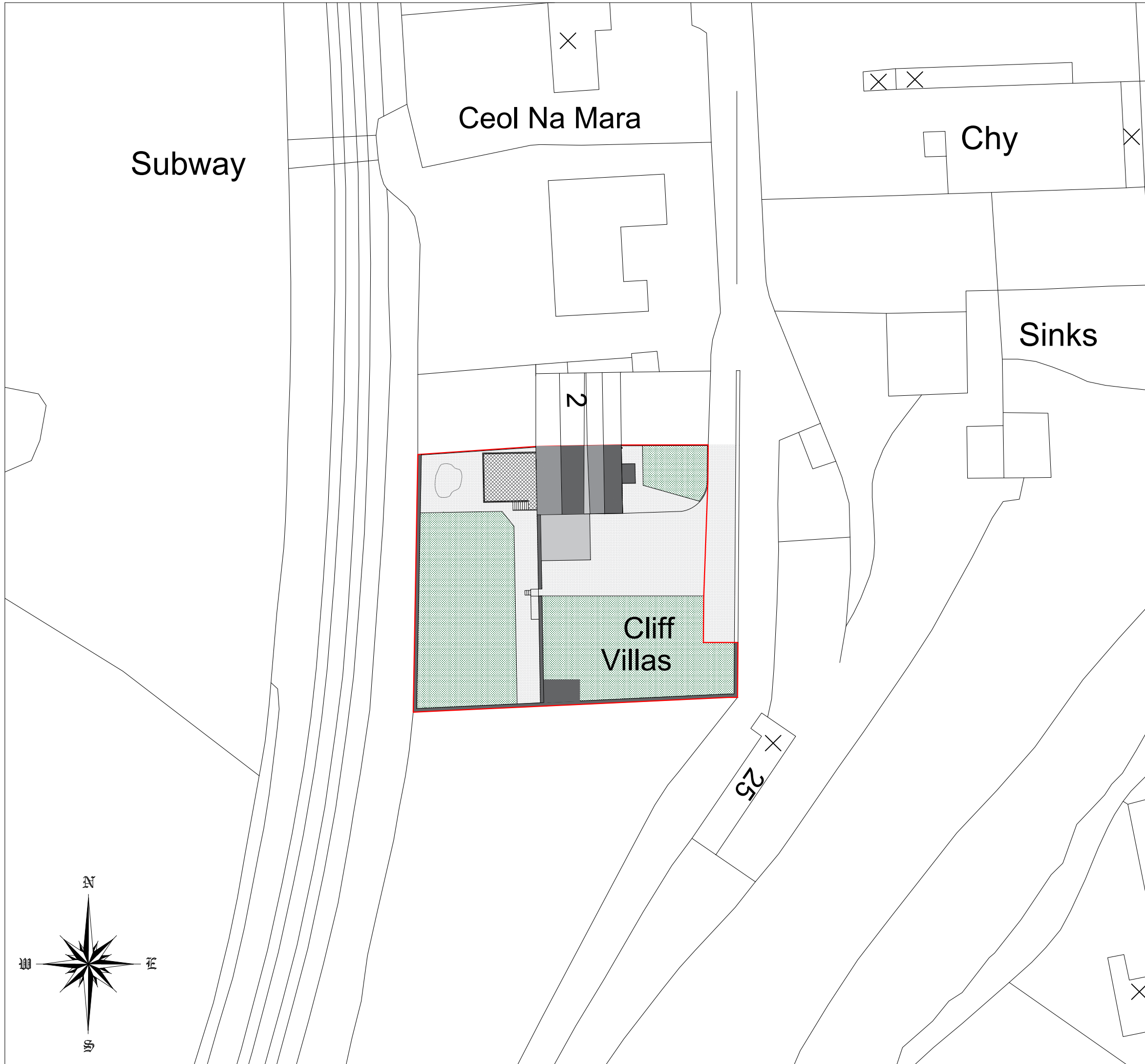
Block Plan 1/500