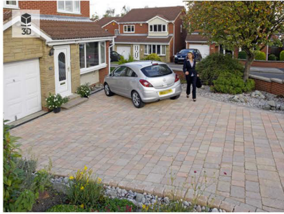
Driveways - Tegula Paving, Marshalls