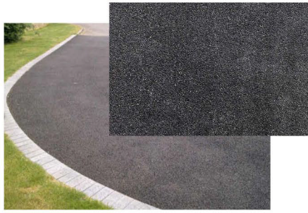
Access Road & Associated Pavement - Tarmac