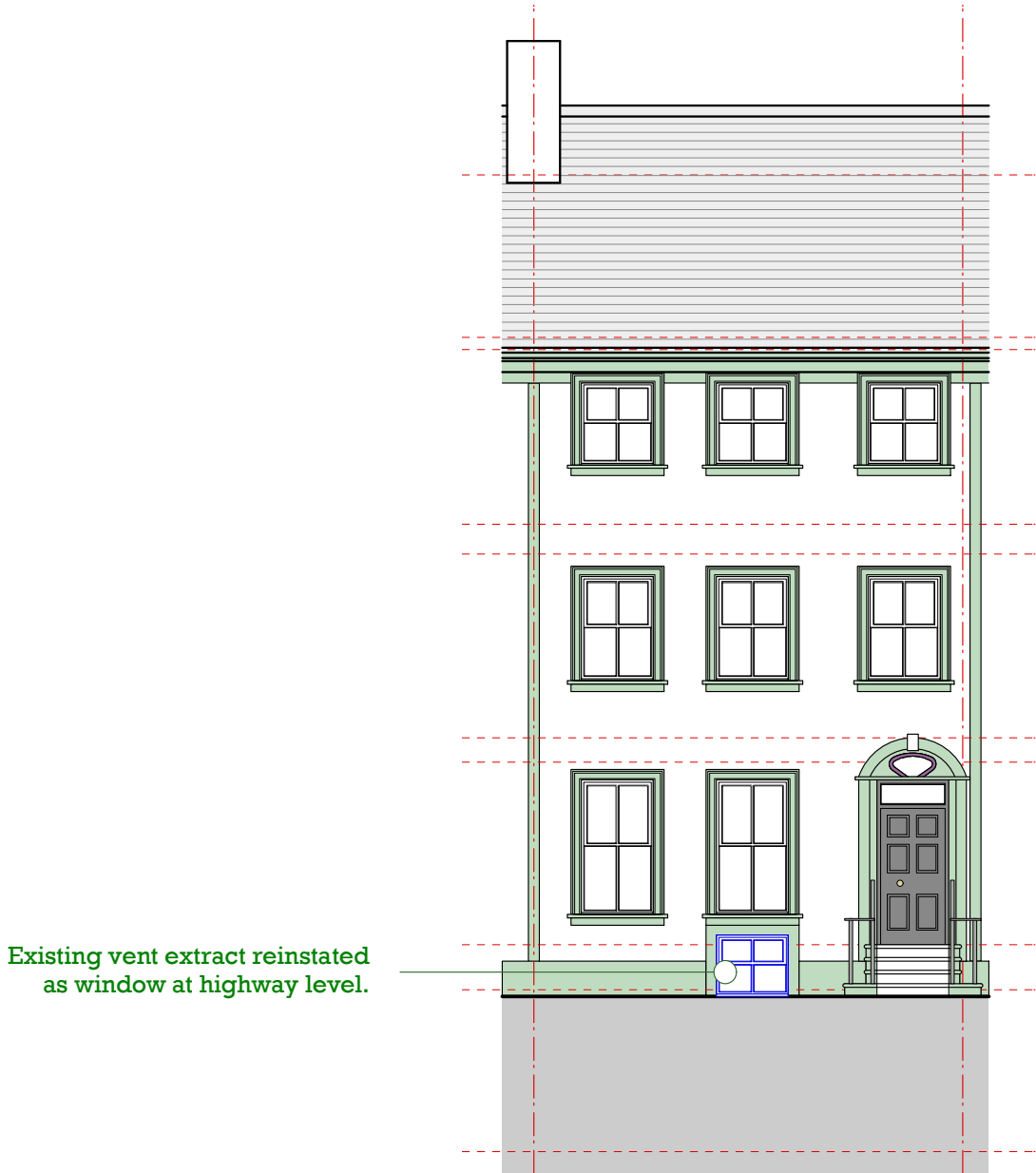
Proposed Front Elevation A (Scotch Street) Scale 1:100 @ A3