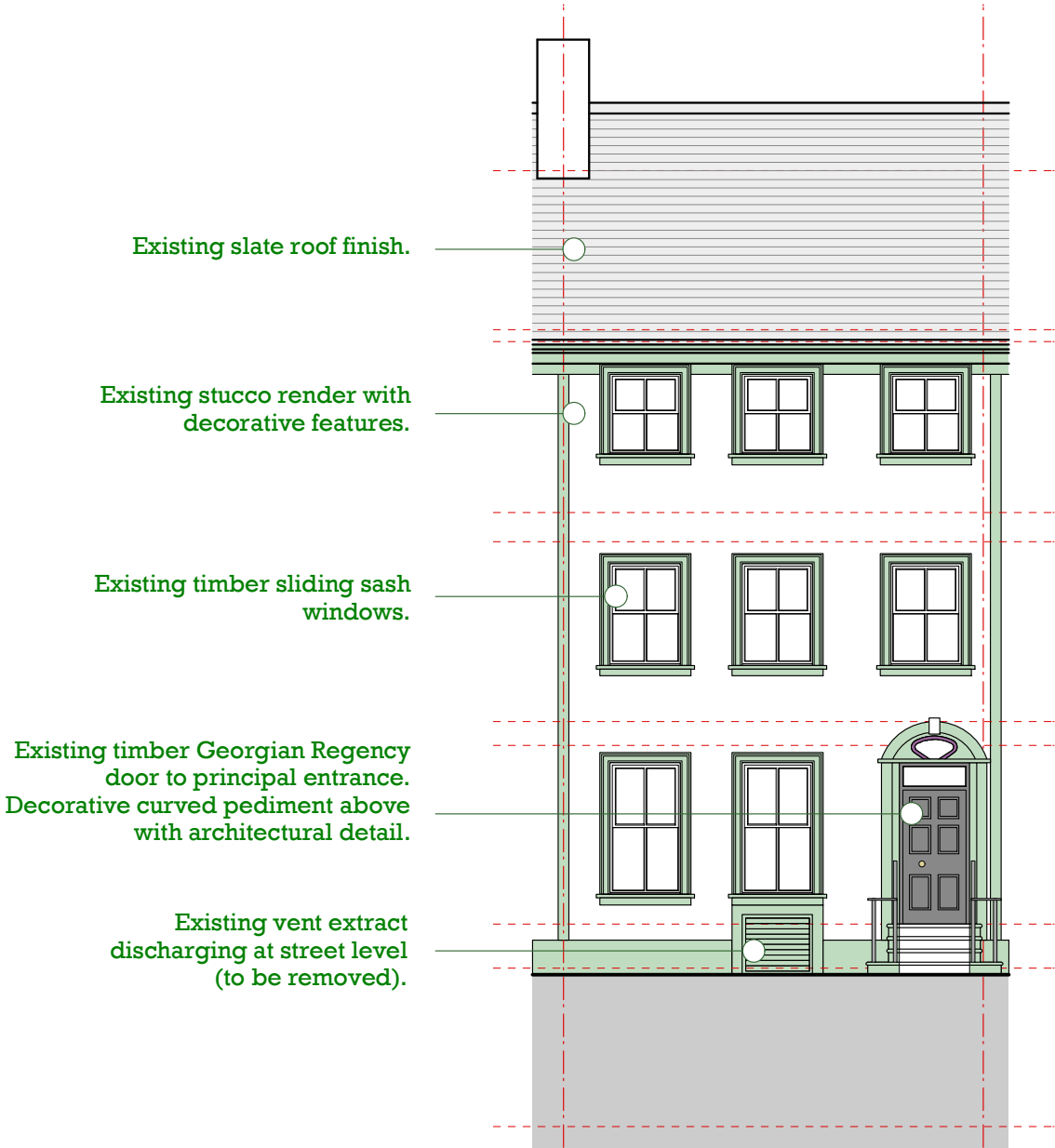
Existing Front Elevation A (Scotch Street) Scale 1:100 @ A3