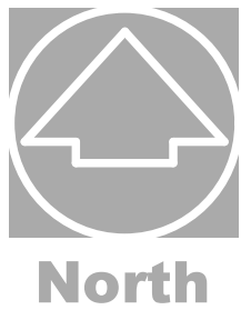
Proposed Site Plan Scale 1:500 @ A1