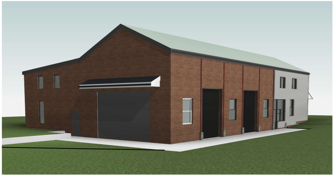
② Proposed 3D View 2