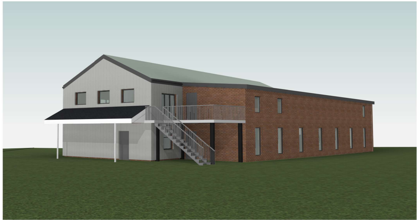
① Proposed 3D View 1