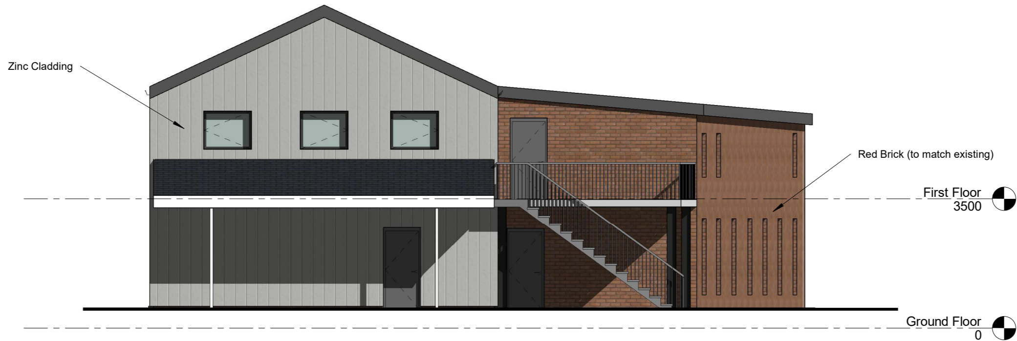
Existing East Elevation Scale 1:100 @ A3