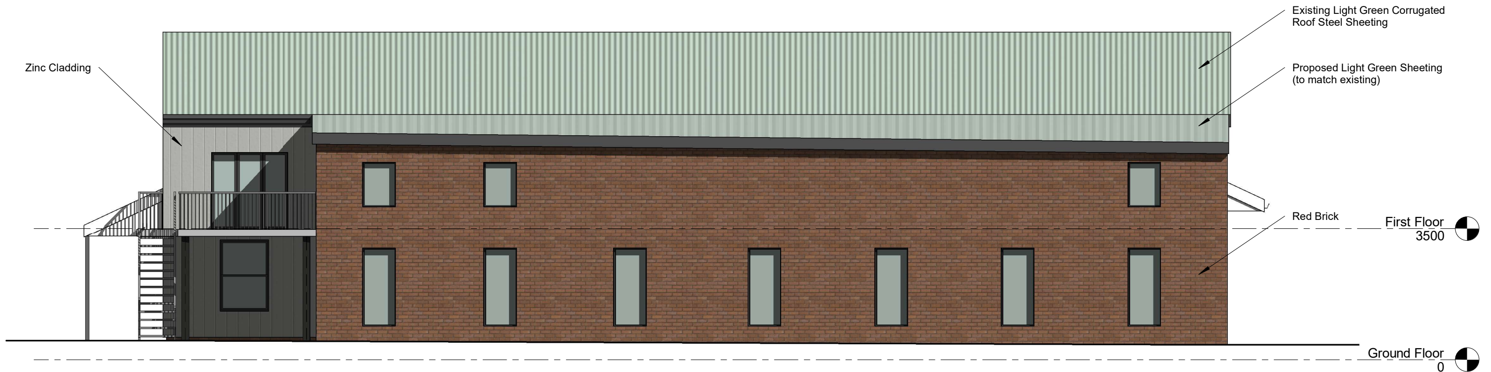
Proposed North Elevation Scale 1:100 @ A3