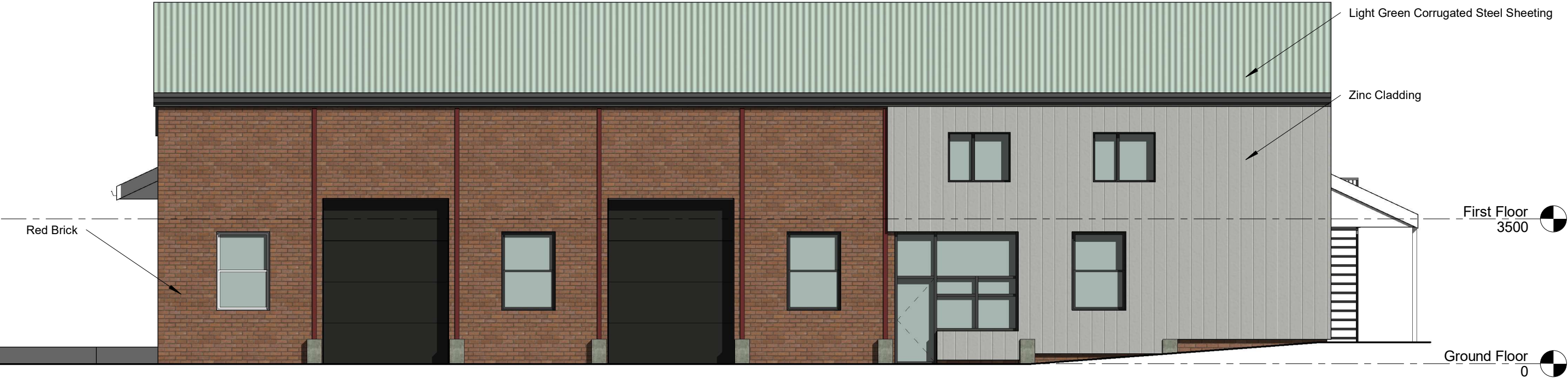
Proposed South Elevation Scale 1:100 @ A3