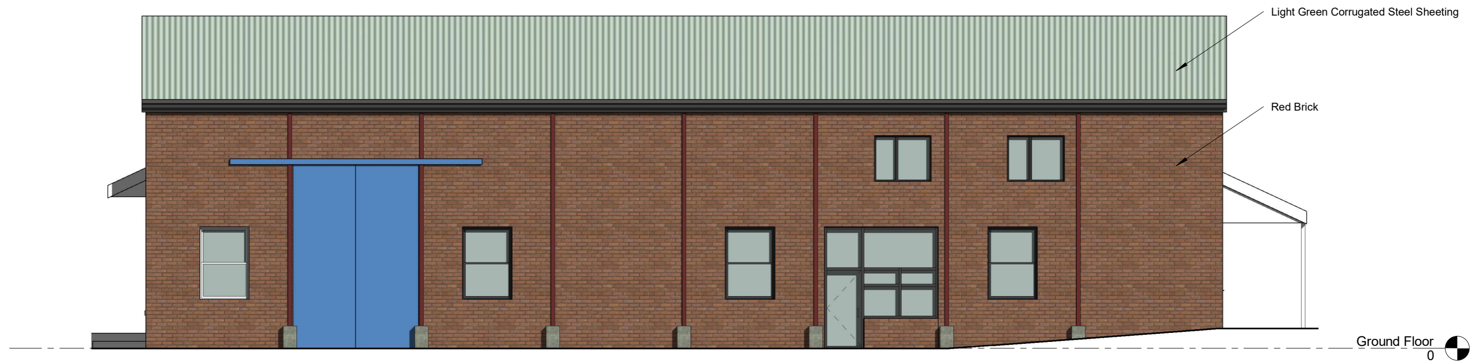
Existing South Elevation Scale 1:100 @ A3