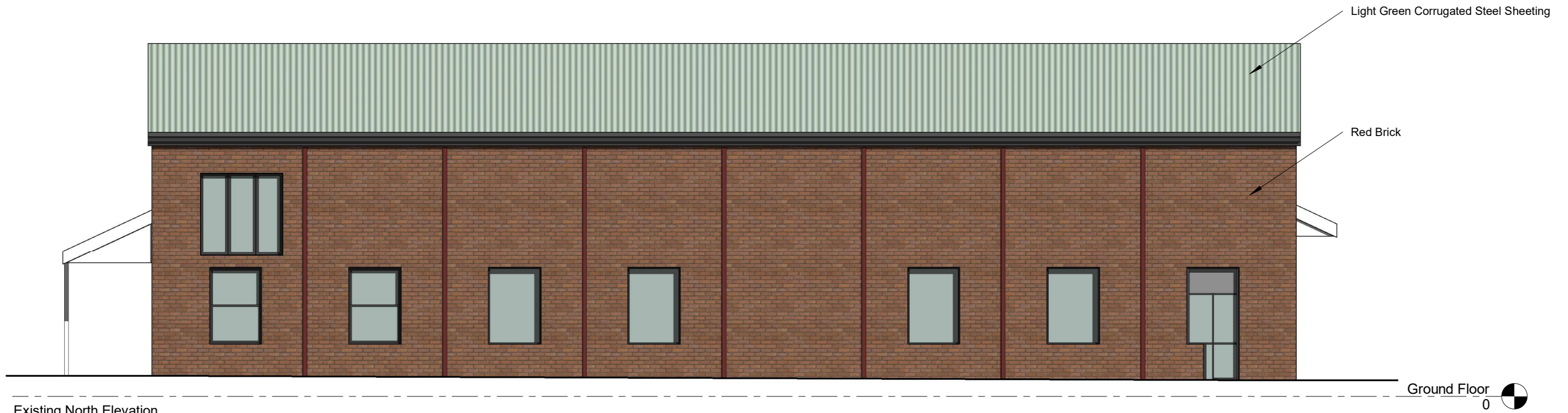
Existing North Elevation Scale 1:100 @ A3