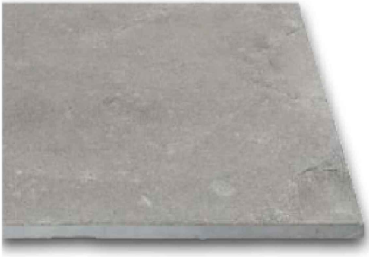
Hard Surface 5 : Marshalls Slyvern natural limestone paving with 'Capleton Pavers' border.