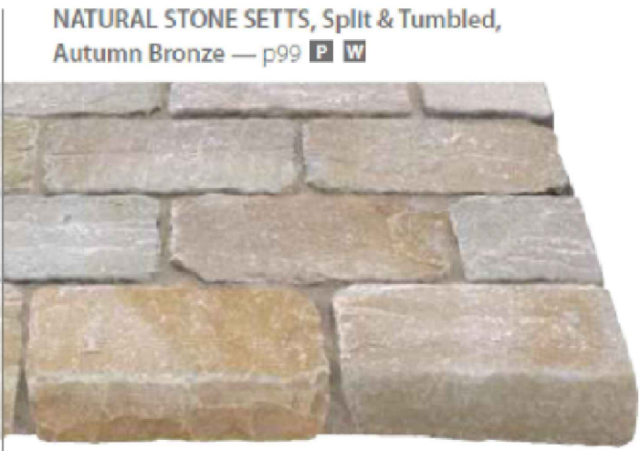
Hard Surface 3 : Marshalls natural stone sets 'split and tumbled, Autumn Bronze' 200mmx100mmx50mm with Marshalls Cropped Granite Eclipse Setts 100x100x100m forming border.