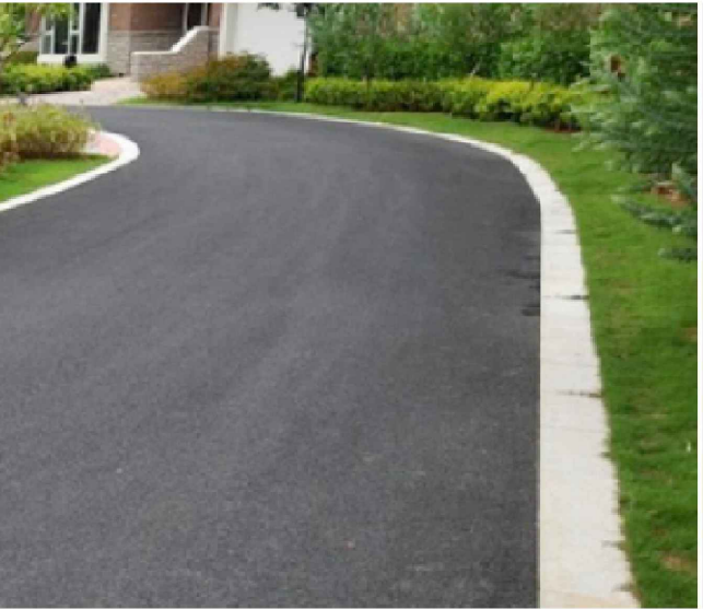
Hard Surface 4 : Tarmac