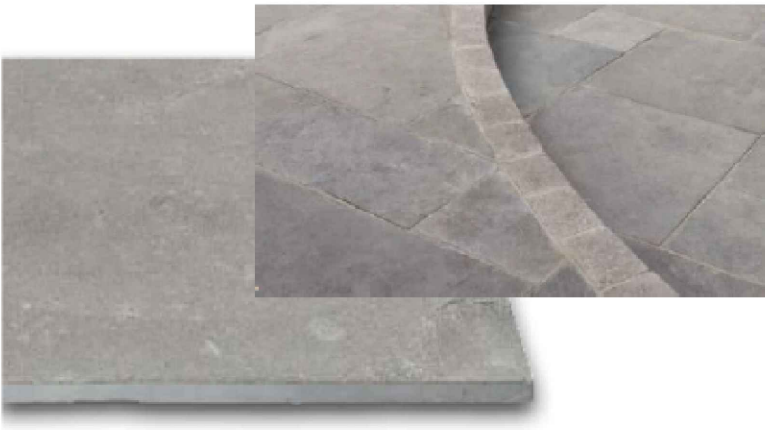
Hard Surface 1 : Marshalls Slyvern natural limestone paving with 'Capleton Pavers' border.