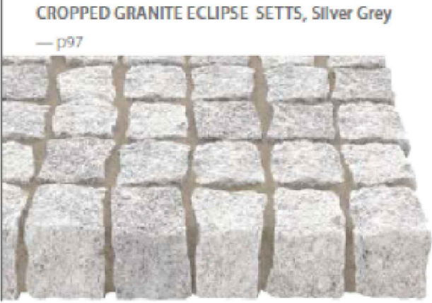
Hard Surface 2 : Marshalls Cropped Granite Eclipse Setts 100x100x100m