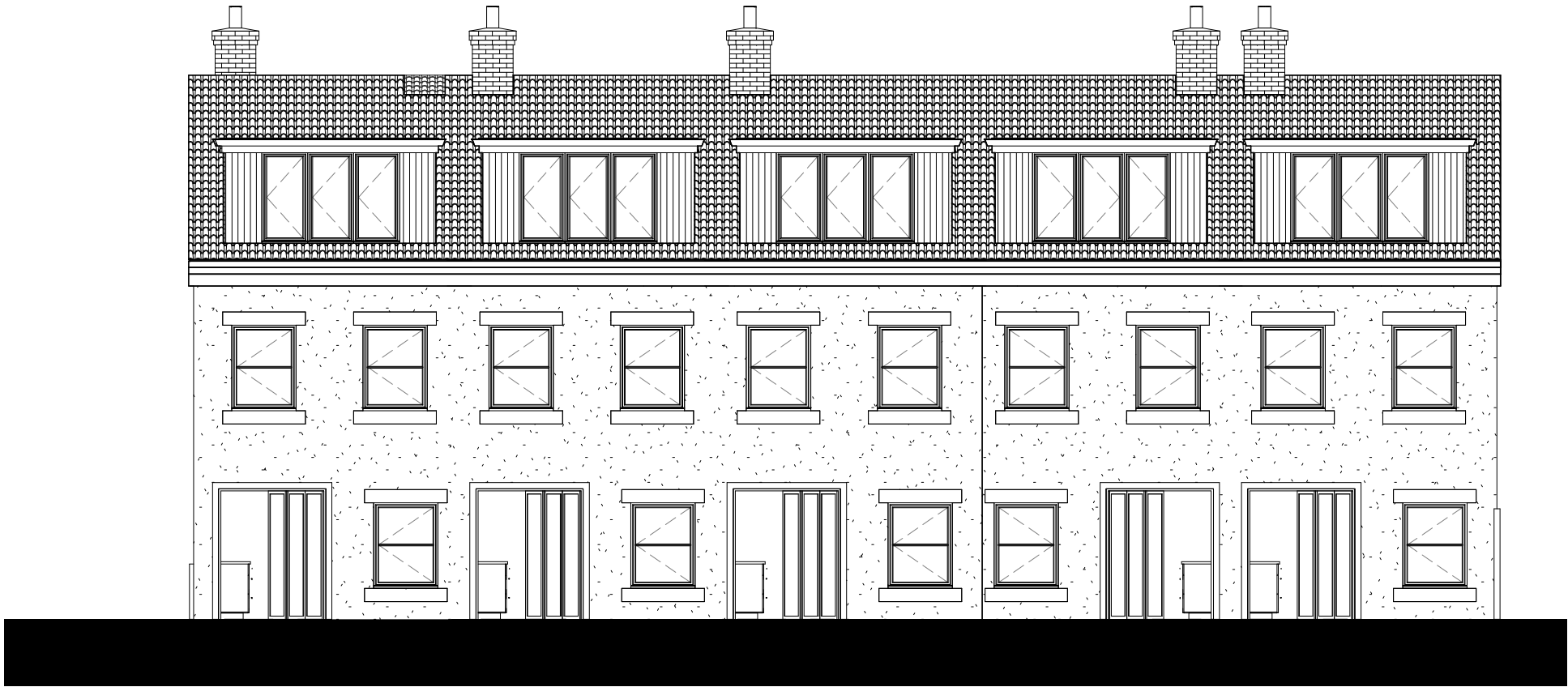
Proposed Street Scene Scale: 1:100

Copyright. This drawing and design and all the information contained therein is the sole copy right of G9 Design, and reproduction in any form is forbidden unless permission is obtained in writing. All dimensions to be checked on site. No dimensions to be scaled from this drawing. All Contractors must visit site and be responsible for taking and checking all dimensions relative to this work. The Architect must be advises of any discrepancies in writing.